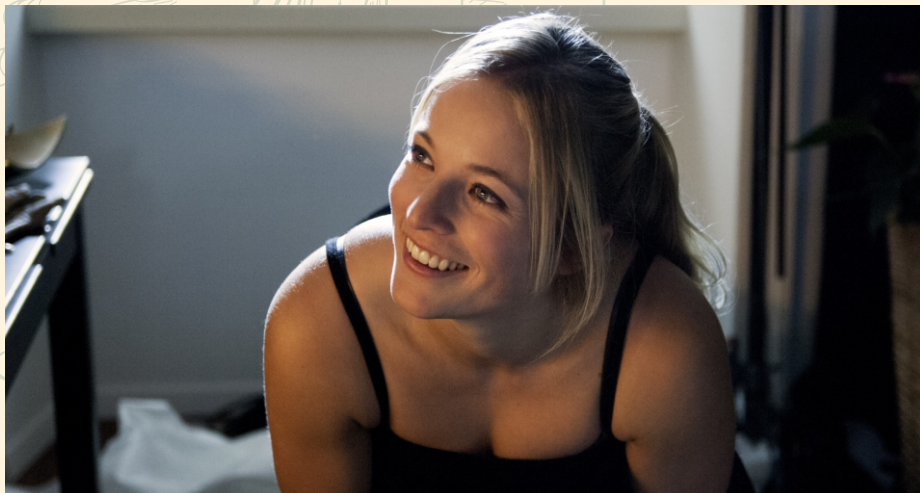
Lara Gut , Swiss ski star, as Chiara

A movie about the transition from the teenager years to adulthood. Adolescents like thousands of others. Three teenagers whose lives are sports. Jullo "is" his skateboard; Chiara conquers the world on skis; Edo is a sprayer. One day Jullo, Chiara and Edo suddenly discover their own lives, each in their own way. Fears, dreams, surprises, loneliness, uncertainty, expectations. Then one moment, one second, one "click." A click, after which they rediscover themselves, that leads to adulthood – or unsparingly carries them away. Live, grow up trying to keep on dreaming future that belongs to them, because the strongest thrive is living the own passion, live for what makes your heart beat, live for yourself in a "not common" world. A movie that describes a moment in the life, when you feel alone with yourself in front of a big, splendid and frightening emptiness.