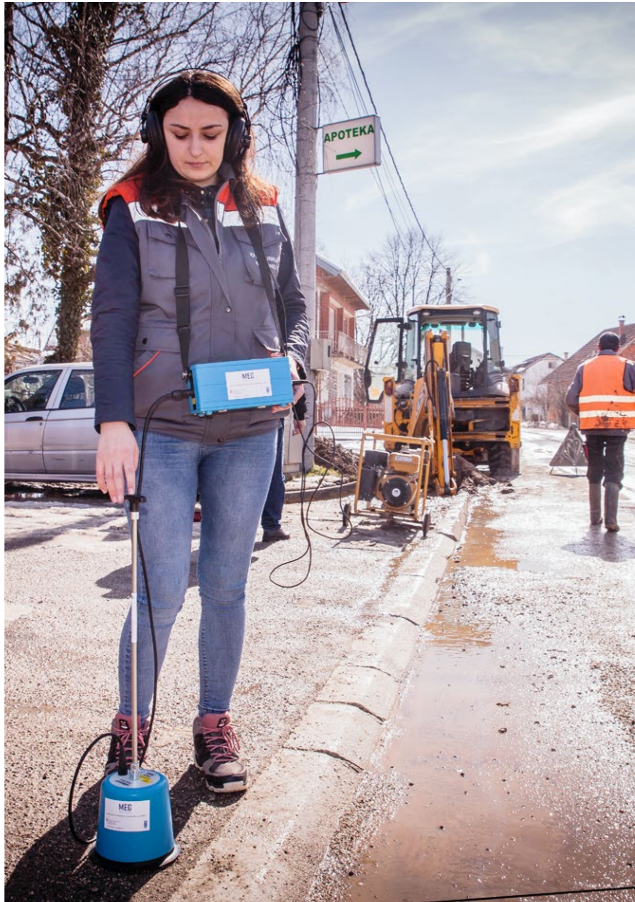
Repairing water pipes: Authorities are supported to provide better access to drinking water and ensure waste water treatment. Municipal Governance and Environment Project, Kostajnica.