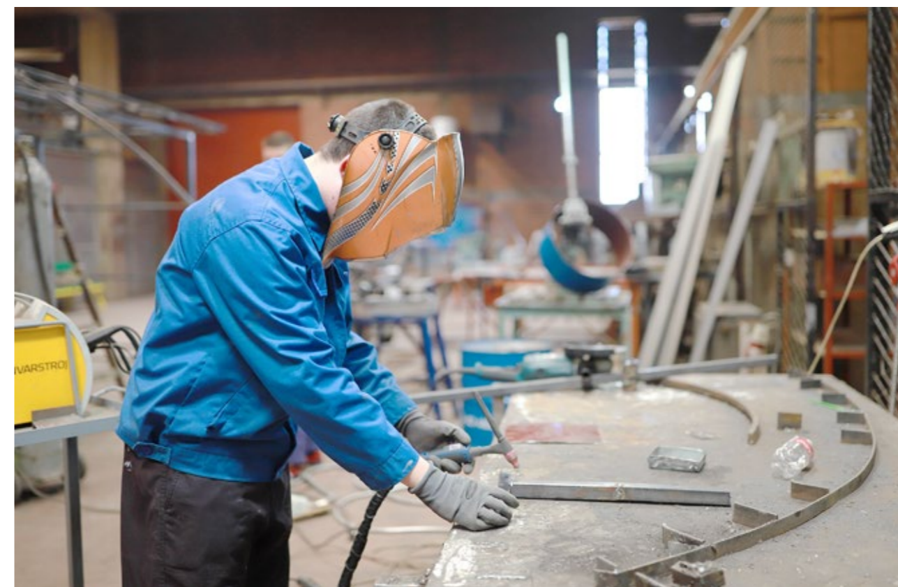
Strengthening vocational educational and training contributes to lower youth unemployment. Strengthening Technical Vocational Education and Training Project, JU Tehnička škola Gradiška.

Outcome statement 2: Local governments (LGs) improve their performance, are more accountable, and provide high-quality and equitable services, in particular in the wa-