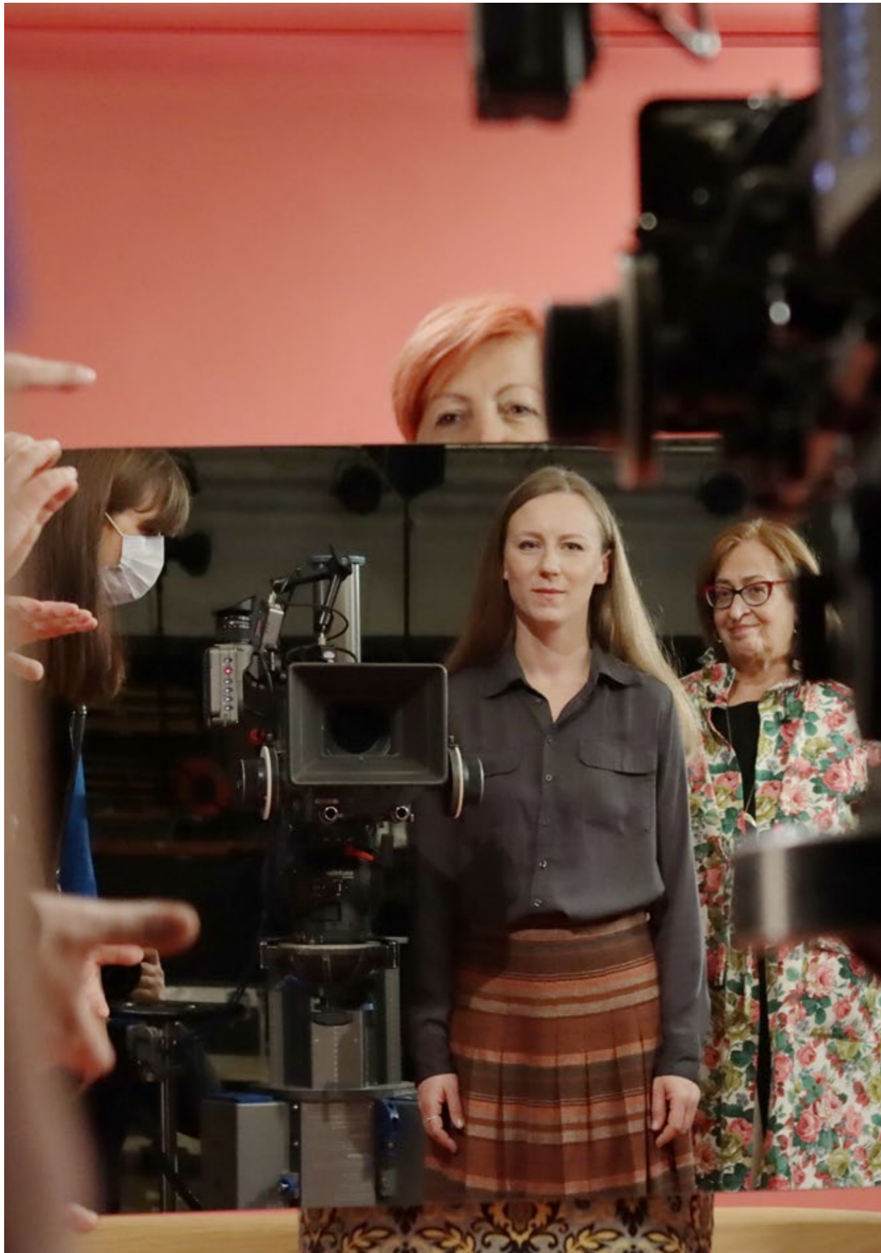
The “Ja glasam za ženu” campaign promotes women’s visibility and participation in politics by asking people to vote for female candidates in local elections.