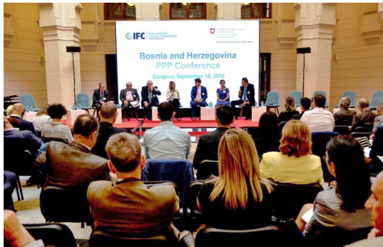
Public-Private Partnerships are essential for achieving progress. PPP conference Public-Private Partnership Project.

The challenge of obtaining results in a country with a complex political system and a limited readiness for consensus will remain. Thus an adaptive management approach will be applied to respond to emerging opportunities and unexpected developments. The reorganisation of the cooperation team will be completed by mid-2021. The reallocation of portfolios will not only allow programme officers to have a fresh look at each project and project partner, but will also allow team members to acquire new skills for the successful implementation of the Cooperation Programme. In addition, Switzerland's increased engagement in policy influencing will require skills development beyond project management.