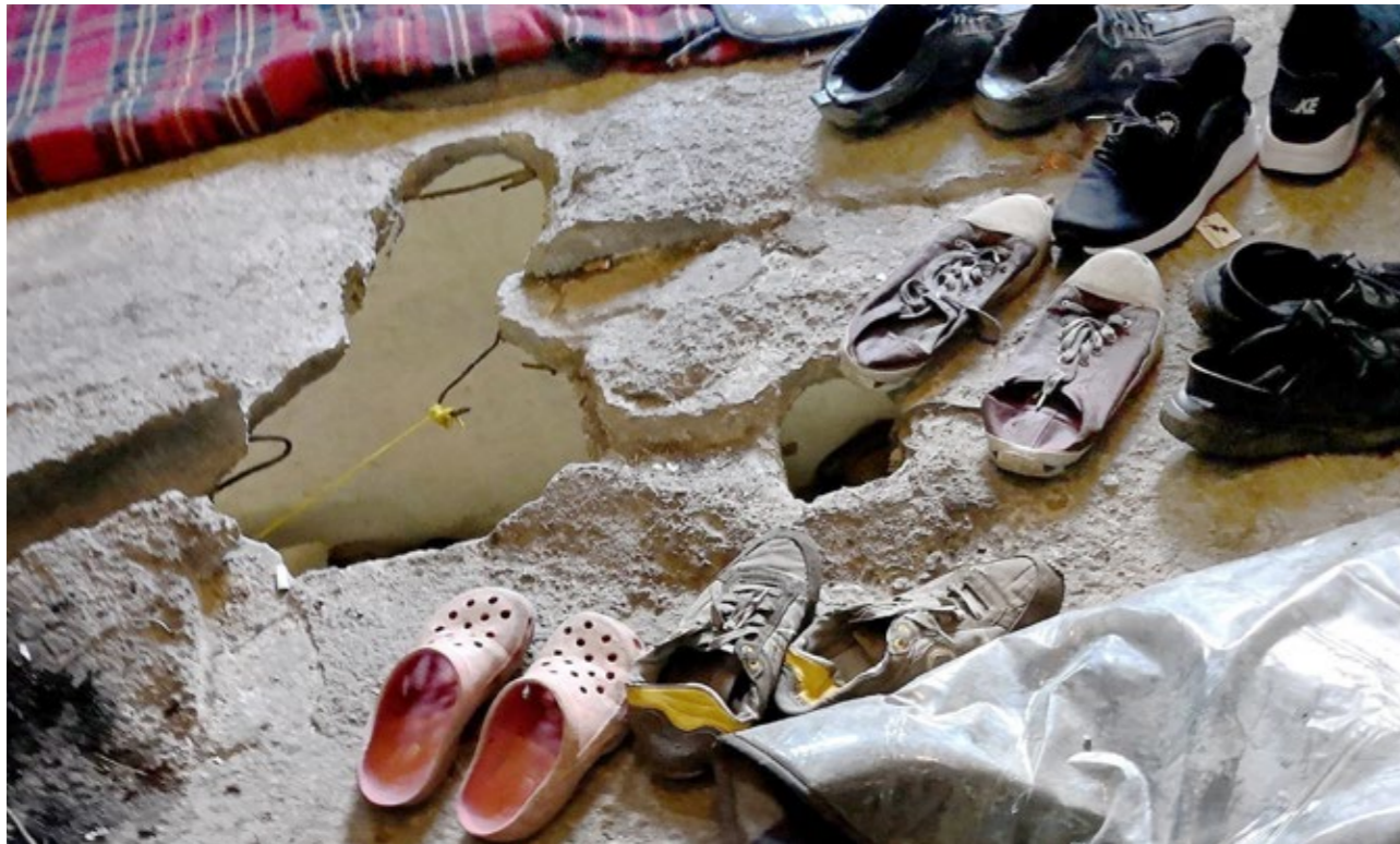
Switzerland supports the provision of health care services to migrants both in official reception centers as well as to people sleeping in spontaneous settlements. Bira Center, near Bihać.