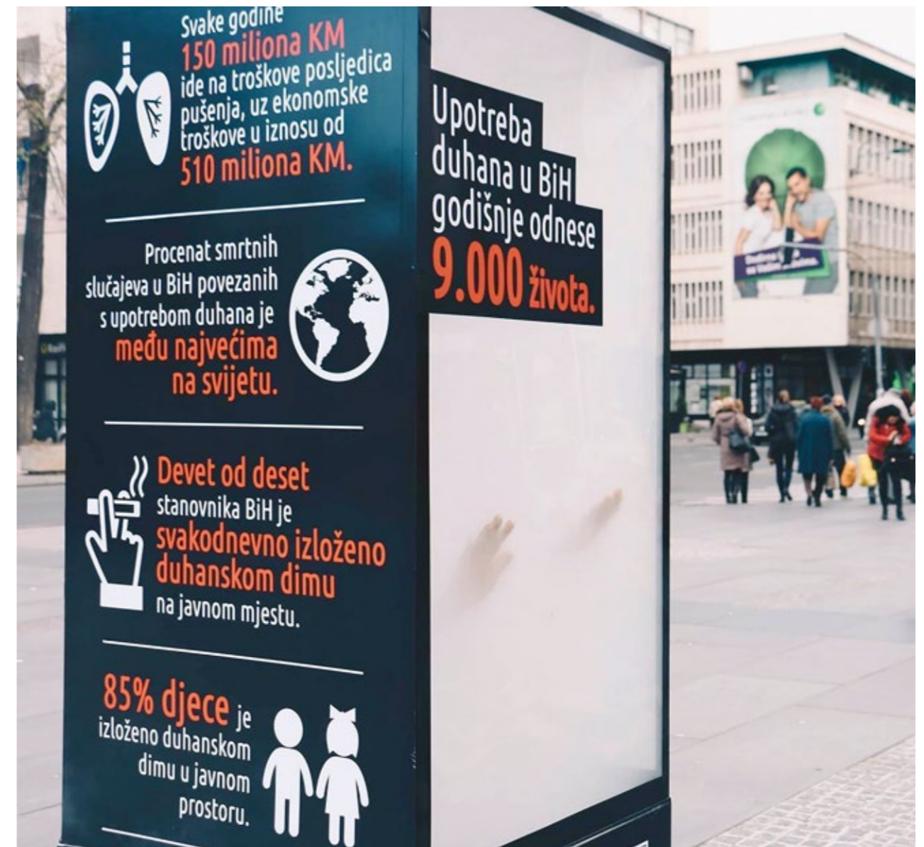
Raising public awareness on the importance of a smoke free environment aims to improve public health. "Klima bez dima" campaign, Reducing Health Risk Factors Project.

A mid-term review of the Swiss Cooperation Programme will assess the relevance of the Programme, report the most important results with regard to the Programme's strategic objectives, identify any necessary adaptations and feed into the new Swiss Cooperation Programme.