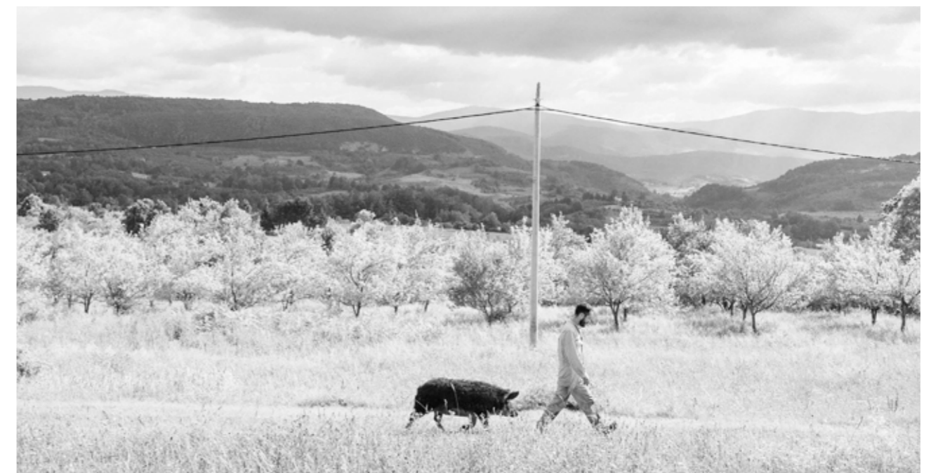
Better service for patients in the community mental health centers significantly reduce the need for patients to be hospitalized. Exhibition “Čovjek je čovjek”, Mental Health Project.