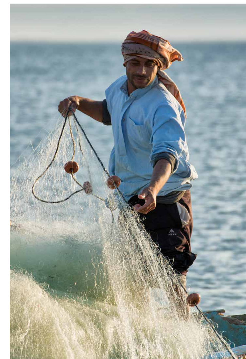
The Nile is a source of life for the people of Egypt.

throughout North Africa. The fragmented armed conflict and fragility in Libya and the emergence of the so-called Islamic State as a transnational threat with offshoots in Europe and Africa have added new security challenges to the region. Egypt's diplomatic efforts actively promote political solutions to end the conflicts in Libya and Syria and to advance solutions between Israel and the Occupied Palestinian Territory. In addition, Egypt has vowed to combat violent extremism through security measures and moderation of the religious discourse.