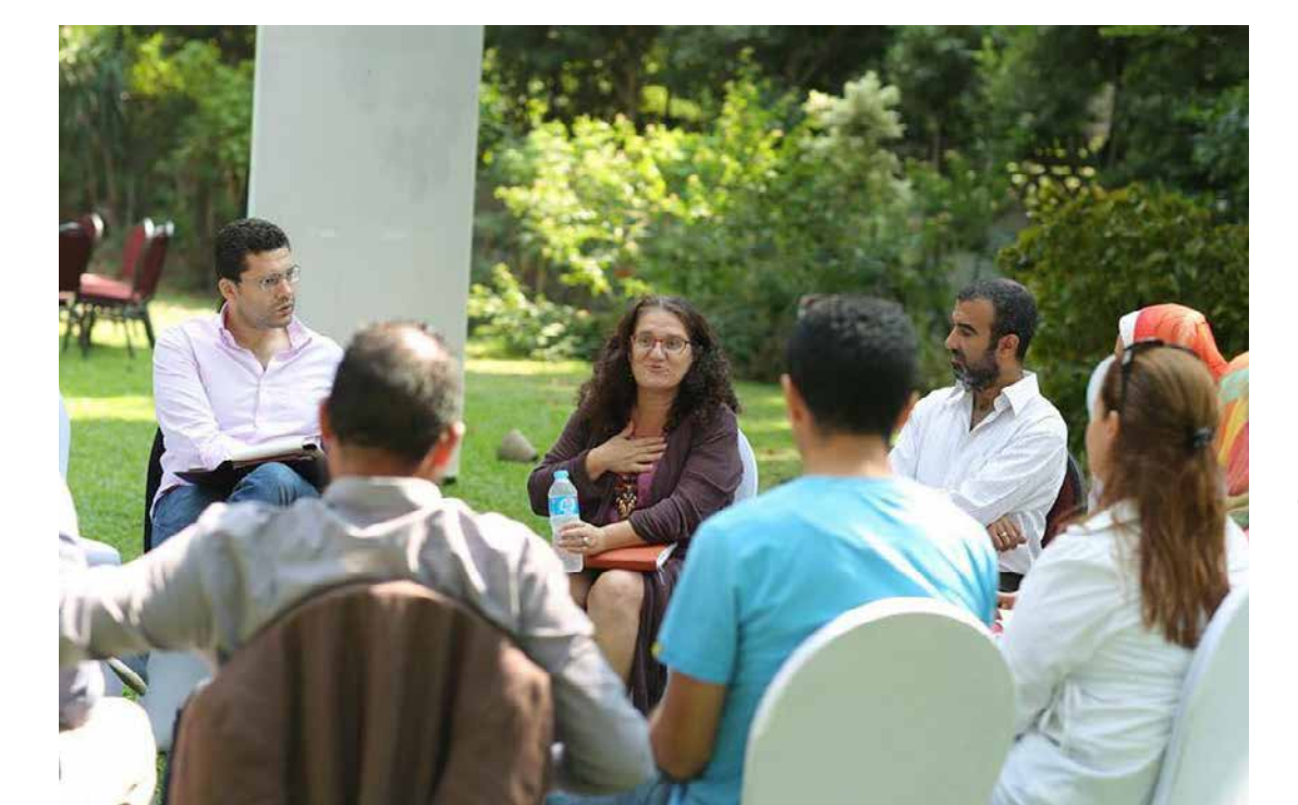
Egyptian Dialogue Market Forum to create an exchange platform for local and international dialogue actors operating in Egypt.

Strategic steering and flexibility : A strategic portfolio approach will guide programme development and implementation. The right combination of focused strategic activities and flexible adaptations will be applied, based on context changes. Flexibility implies revising implementation when necessary while keeping the overall objectives and outcomes firmly in view in order to ensure the effective management of risks and harnessing of opportunities.