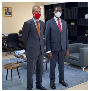
Amb. Stalder with the Minister of Education, Dr. Yaw Adutwum

Ambassador Stalder paid a series of courtesy calls to newly appointed ministers and members of the government in the first half of 2021. Among them were the Minister for Local Government. Decentralisation and Rural Development, the Minister of Trade Industry, the Minster of Environment, Innovation, Technology & Science,