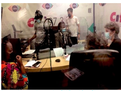
Interaction session on the Citi Breakfast Show

Finally, a visit to the studios of CitiTV and CitiFM was an opportunity to highlight on air the outstanding value of a vibrant media scene for democracies like Ghana and Switzerland. You can find more details as well as a short video on the Minister's visit here.