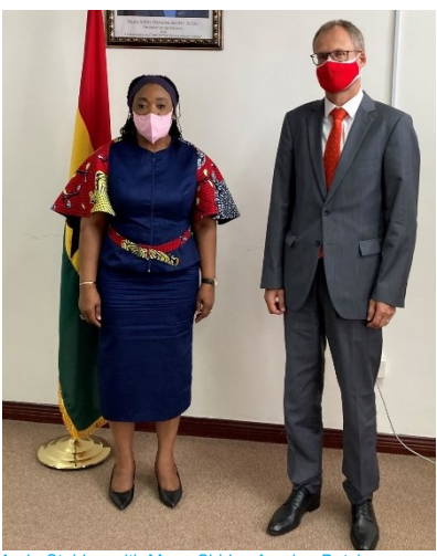
Amb. Stalder, with Mme. Shirley Ayorkor Botchwey

Next was a call on the Minister for Foreign Affairs and the Minister of Finance. Foreign Minister Shirley Ayorkor Botchwey was also informed about the growing importance of Africa in global issues and as such, the launch of Switzerland's first ever Sub-Saharan Africa Strategy.