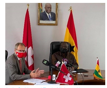
Amb. Stalder and Trade Minister, Alar Kyeremanten, speaking to journalists