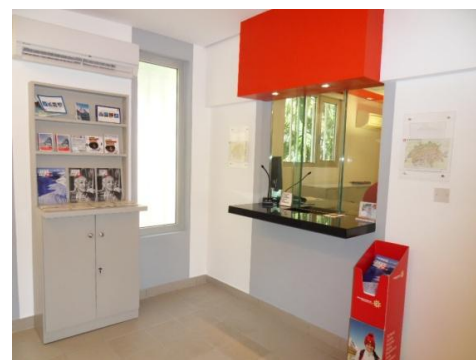
New counter and...

In conjunction with this change in procedures, a new waiting area and an additional counter were built at the chancery. There are now three counters in two waiting rooms, one of which (the newly constructed one, see pictures) is predominantly reserved for Swiss citizens. The new facilities will contribute to improve the Embassy's customer service.