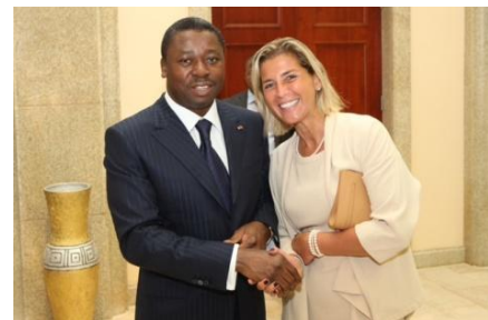
...and the Togolese President Faure Gnassingbé