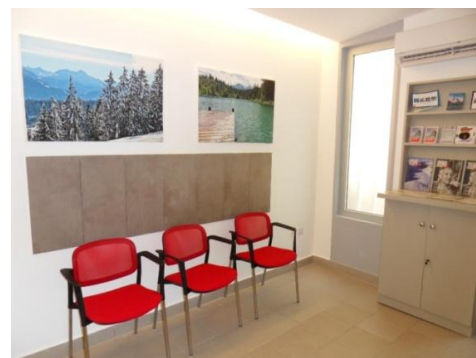
... new waiting area

The Embassy has published further information about VIS on its website: http://www.eda.admin.ch/eda/en/home/rep/afri/vgha/repgha/swinef.html