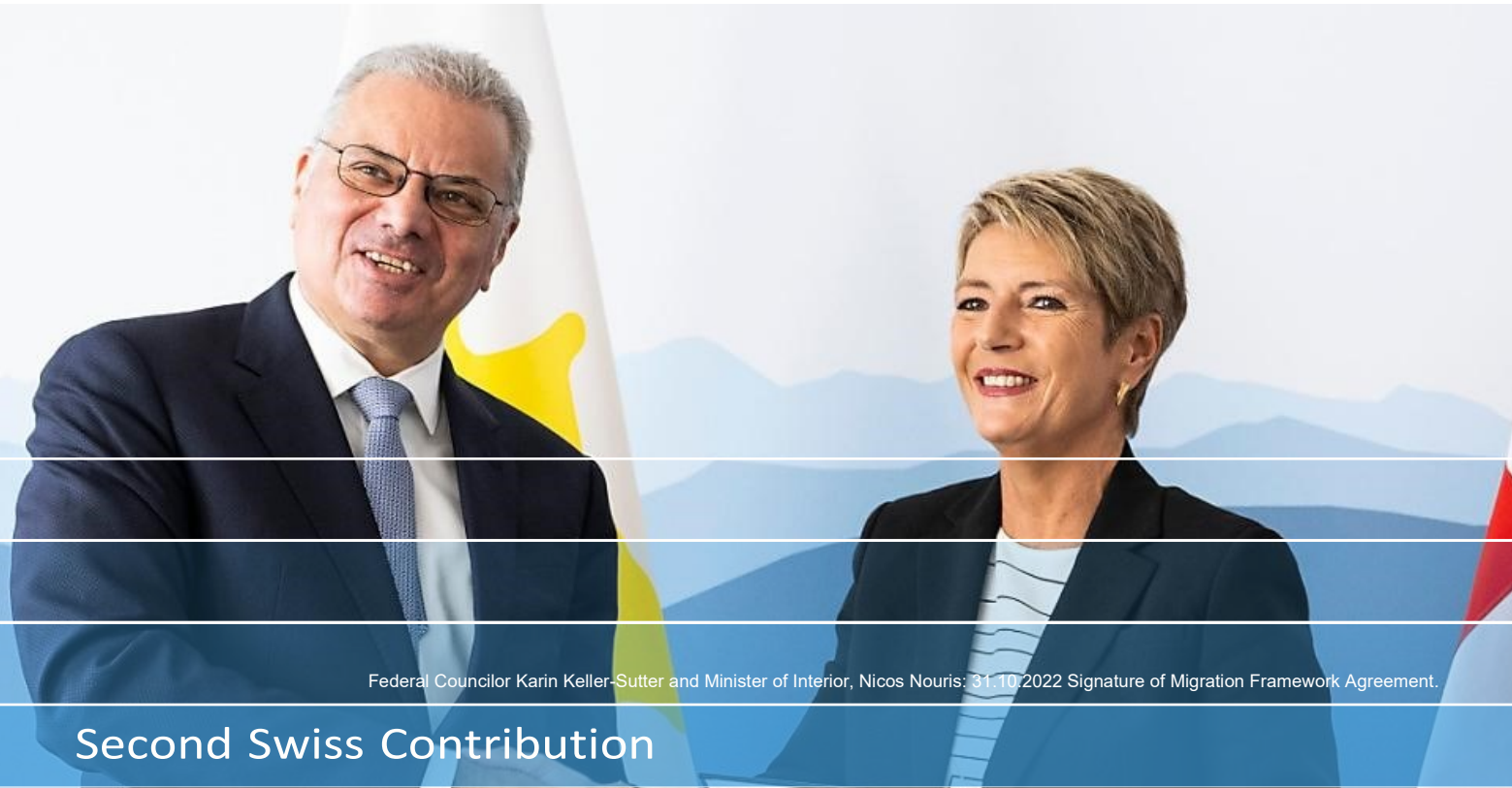
Federal Councilor Karin Keller-Sutter and Minister of Interior, Nicos Nouris: 31.10.2022 Signature of Migration Framework Agreement.