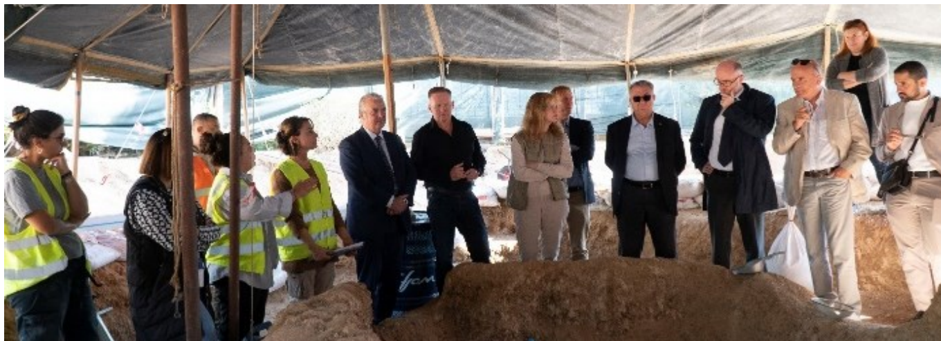
Ambassador's visit to the excavation sites in the norther part of Cyprus, 24 November 2023.

the process. The expected output is for the remains of missing persons to be recovered, identified and returned to their families.