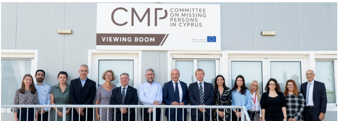
Group photo with the Embassy of Switzerland and the Committee on Missing Persons in Cyprus October 2023.

The Committee on Missing Persons in Cyprus (CMP) is a bi-communal body established in 1981 by the leaders of the Greek Cypriot and Turkish Cypriot communities with the participation of the United Nations. Following the establishment of an agreed list of missing persons, the CMP's objective is to recover, identify, and return to their families, the remains of 2002 persons (492 Turkish Cypriots and 1,510 Greek Cypriots) who went missing during the inter-communal fighting of 1963 to 1964 and the events of 1974.