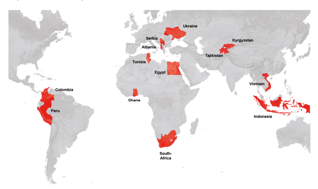
Figure 2: SECO's geographic focus

In addition to its involvement in the priority countries, SECO also implements selective complementary measures based on its thematic areas of expertise. The objective is to be able to respond selectively and flexibly to specific challenges in different domains, such as migration. SECO's bilateral activities are complemented by global measures , which address global challenges related to Finance and Trade, Migration, Climate Change and Environment, and Water.