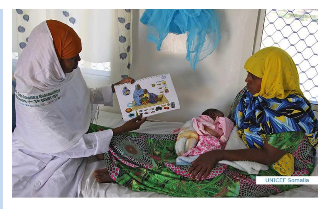
Mother of a new born receiving post-natal nutrition advice from a health worker at a Maternal Child Health Centre, Somaliland.