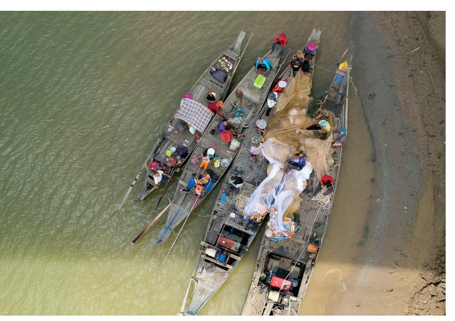
Ethnic Cham people in Cambodia's Kampong Cham live in the boats and depend their livelihoods on the river.

The Mekong River Commission is the only treaty-based intergovernmental organisation for the Mekong River Basin with a mandate for integrated water resources management, procedures and tools to support equitable use of water and address transboundary issues. Switzerland with its experience in water diplomacy and integrated water resources management contributes to the implementation of the Basin Development Strategy (BDS 2021-2030) and MRC's Strategic Plan (MRC SP 2021-2025) through the multi-donor Basket Fund.