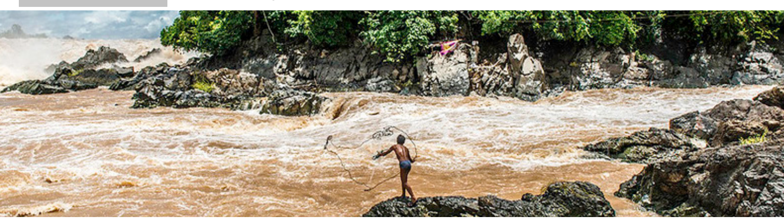
A fisherman in Khon Phapheng Falls of Lao PDR risk his life to catch fish.

The achievements of the BDS and SP Outcomes and outputs shall specifically/particularly benefit poor and vulnerable communities relying on the Mekong River and tributaries for their livelihood and income. To achieve this long-term aspiration, MRC's role and procedures should continue to be strengthened and further used by the Member Countries government's; and the broader stakeholders, including CSOs and communities more effectively and meaningfully engaged in the MRC prior consultation processes for the development of hydropower projects.