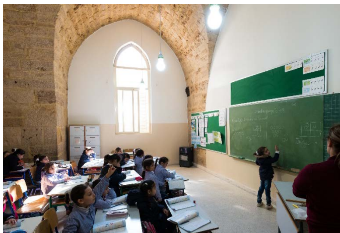
Rehabilitated class room in Zgharta Area, North Lebanon.