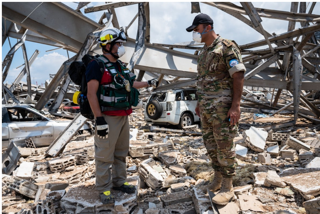
Swiss Hazmat expert searching the site for toxic substances in conversation with an expert of the UN