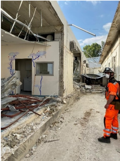
SHA expert assessing a building