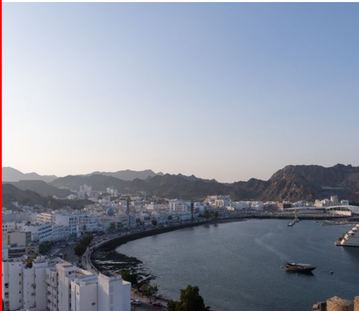
Muttrah Corniche, Oman