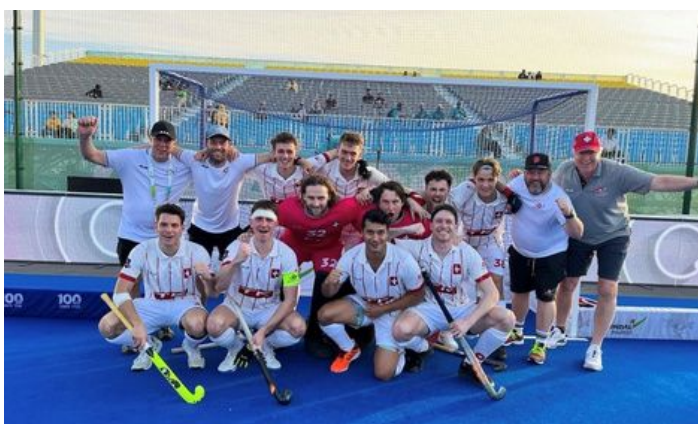
Swiss Hockey Team

In January 2024, the men's Swiss national team for Hockey5s, a new faster version of field hockey, took part in the first ever World Cup that took place in Oman. The Embassy hosted the team for a reception and the staff went to cheer them on during some of their games.