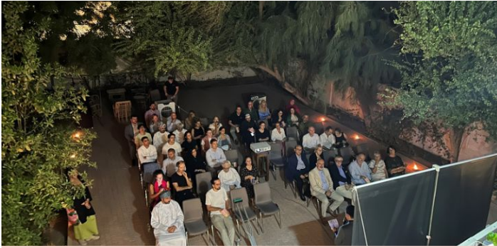
Italian Film Festival