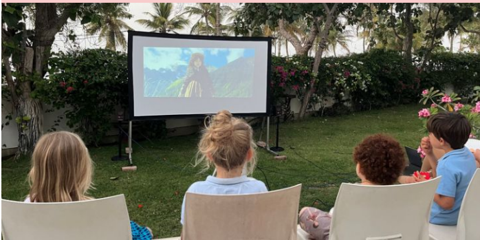
Kids Movie Night