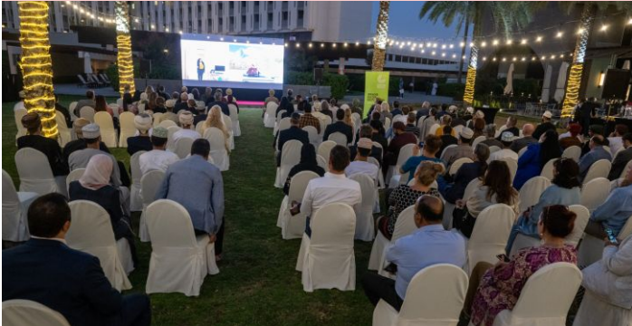
German Film Festival