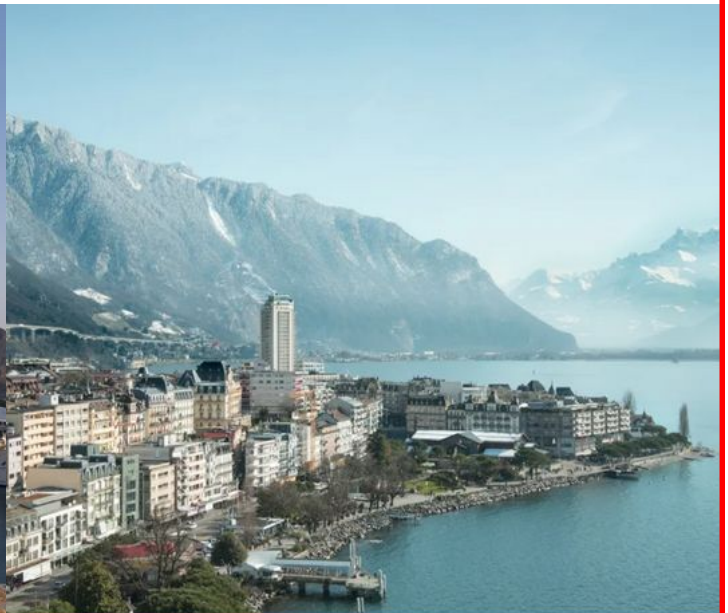
Montreux Riviera, Switzerland

In celebration of the 50th anniversary of diplomatic relations between Switzerland and Oman, the Embassy posted bi-weekly content on their Instagram account highlighting the similarities between the two nations. By the end of the year 2023, we provided a glimpse of what these two countries have in common. To explore more examples of the similarities and other events related to the 50th anniversary celebrations, click here .