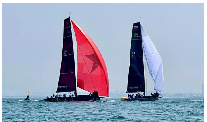
Black Star Sailing

Additionally, in March 2024 the embassy organized a Movie Night for Swiss kids in Oman screening the renowned "Heidi" movie at the Swiss residence garden. This delightful occasion evoked nostalgic memories of childhood and celebrated the lasting impact of storytelling.