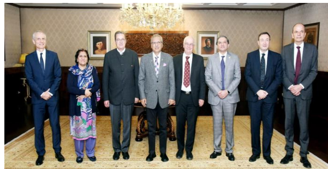
A group photo of the delegation with H.E. Mr. Arif Alvi, President of Pakistan