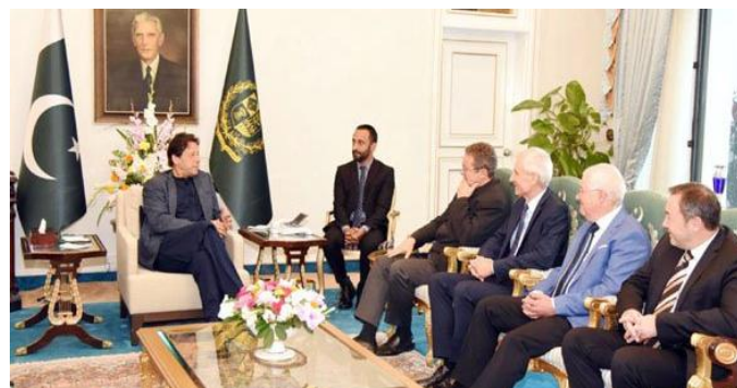
Meeting of the delegation with H.E. Mr. Imran Khan, PM of Pakistan