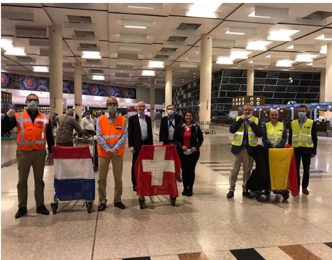
Embassy staff from Belgium, the Netherlands and Switzerland at Islamabad airport on May 6

The Swiss Embassy has been fully mobilized to help Swiss nationals and their families in Pakistan and Afghanistan in the early stages of the outbreak. Together with the local government and in collaboration with the Embassies of Germany, Denmark, France and the Netherlands, Swiss nationals and their families in Pakistan (in total 35 people), who expressed the wish to leave the country, could be repatriated between March 31 and May 27 with flights to Oslo, London and Paris. Additionally on May 6, the Embassy of Switzerland together with the Embassies of Belgium and the Netherlands chartered a plane and was able to transport sixteen Swiss nationals to The Hague.