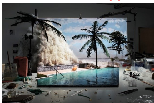
Recreation of "Tahiti" by Jojakim Cortis, 2015, 2015

Stories That Matter is an annual programme by Objectifs, that looks at critical issues in our world through film and photography. In 2019, Objectifs will explore the theme of "Myths", to consider how national, political and popular narratives shape our perceptions of the world. Stories That Matter unpacks the role that myths play in our lives through photography and film, because how we see is as important as what we see.