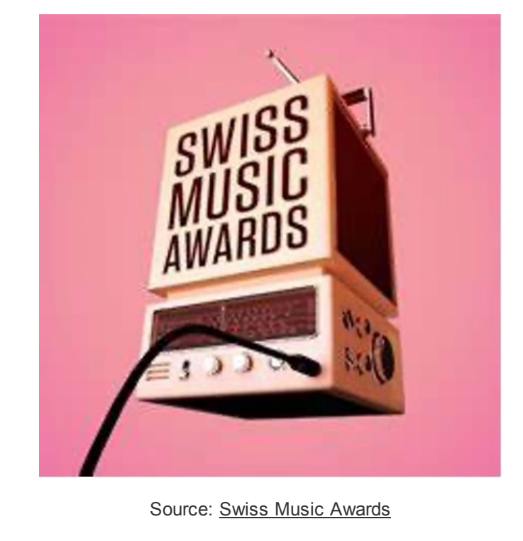
Meanwhile in Switzerland... Swiss Music Awards

Get more information on Capital Pride celebrations here.