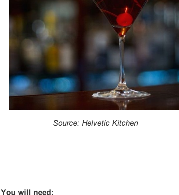
Grand Marnier Rouge

Acclaimed in Europe's contemporary music scene, the Lugano Percussion Ensemble is based in its namesake city in the Italian-speaking part of Switzerland. Founded in 2000, its first members were