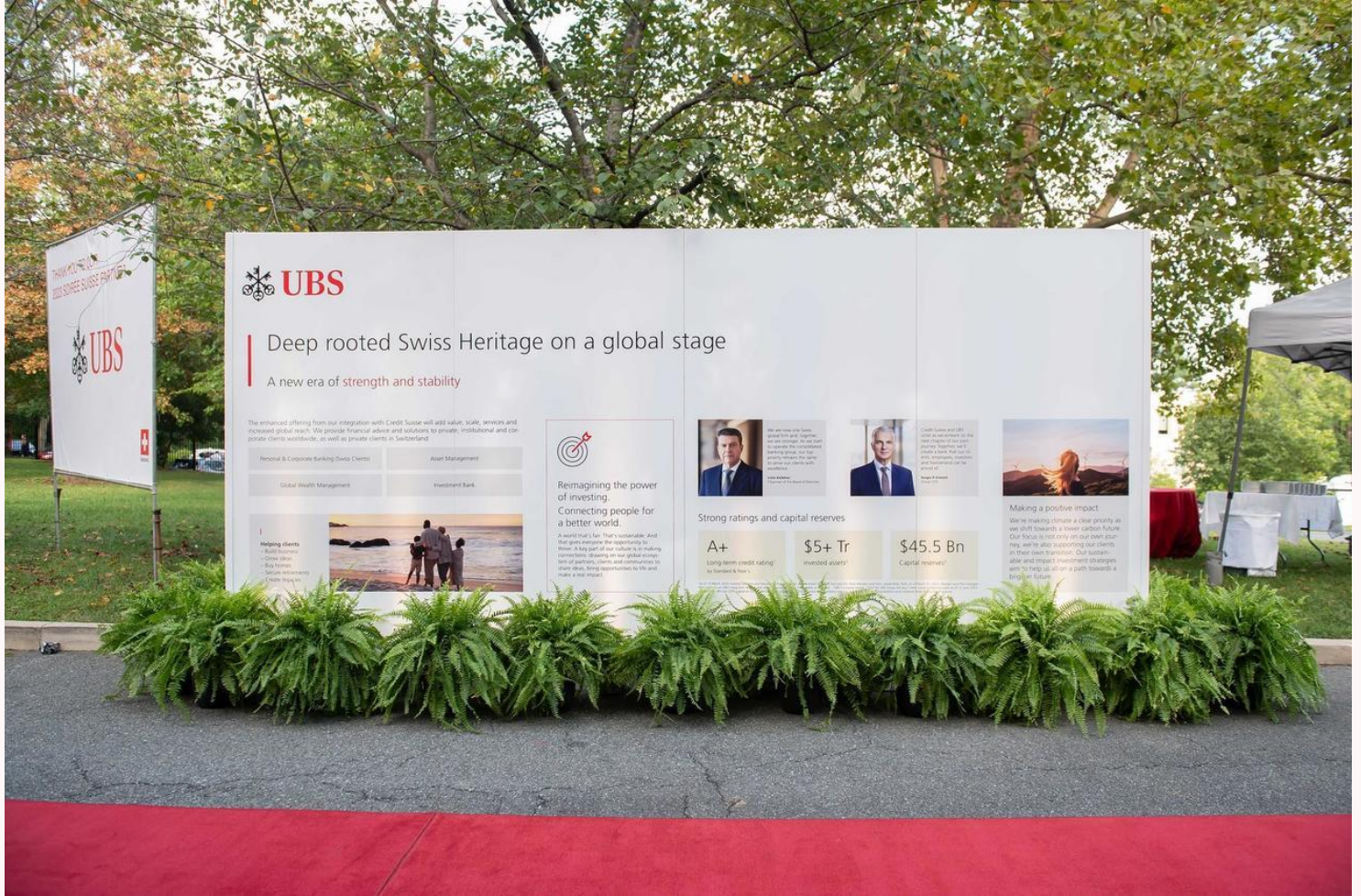
The partner sponsor at this year's Soirée Suisse, for the second year in a row, was UBS.

In the world of global banking, UBS stands out as a symbol of Switzerland's tradition in the finance sector and its commitment to innovation. The Embassy of Switzerland in the United States was honored to once again welcome UBS as its partner sponsor for the 2023 Soirée Suisse.