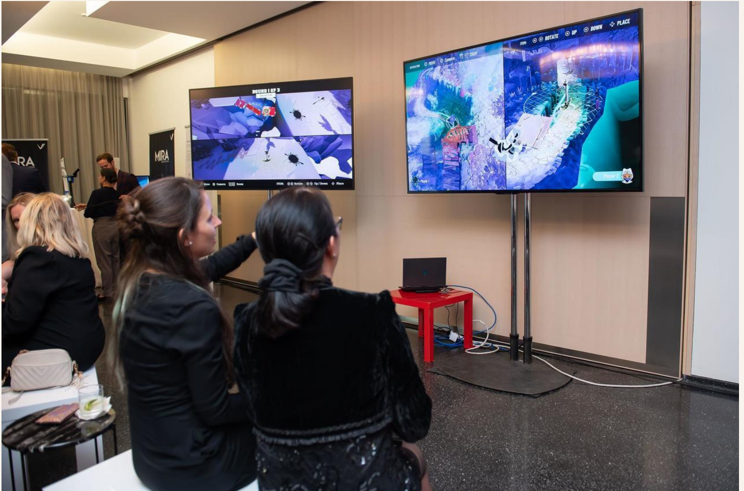
Let the games begin: Ninoko offered an exclusive preview of its upcoming multiplayer game.