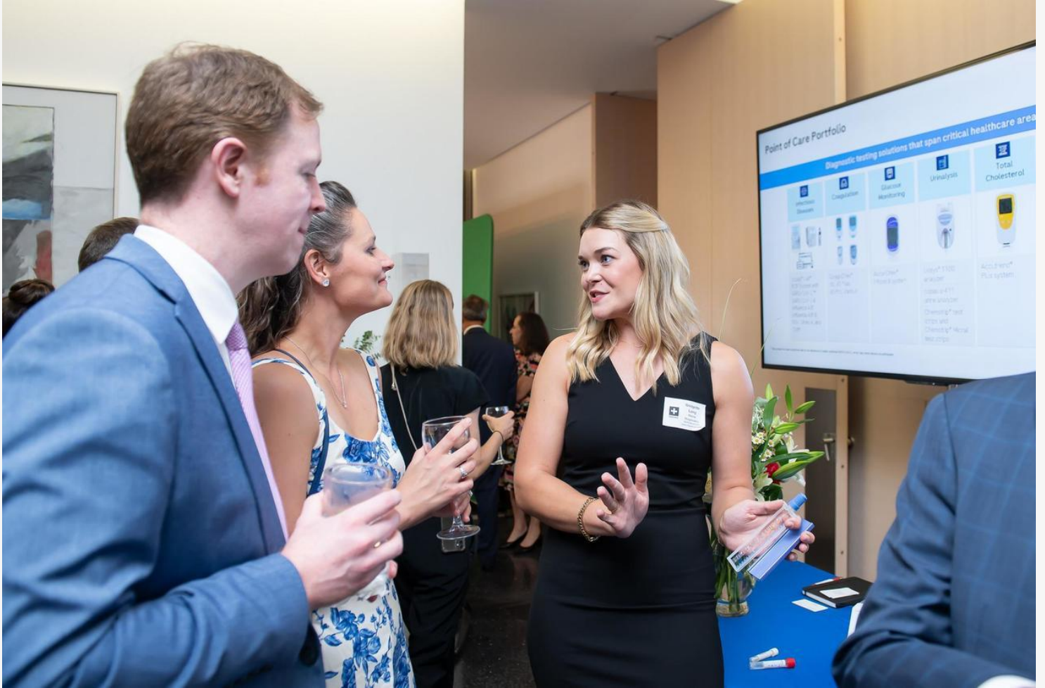
At the Roche activation, guests learned about recent innovations in diagnostics and digital healthcare solutions.

Roche is rewriting the narrative of healthcare through groundbreaking advancements and steadfast dedication. A global pharmaceutical company with a legacy spanning over a century, Roche has consistently pushed the boundaries of science to improve and extend the lives of millions worldwide in the face of the world's most critical medical challenges.