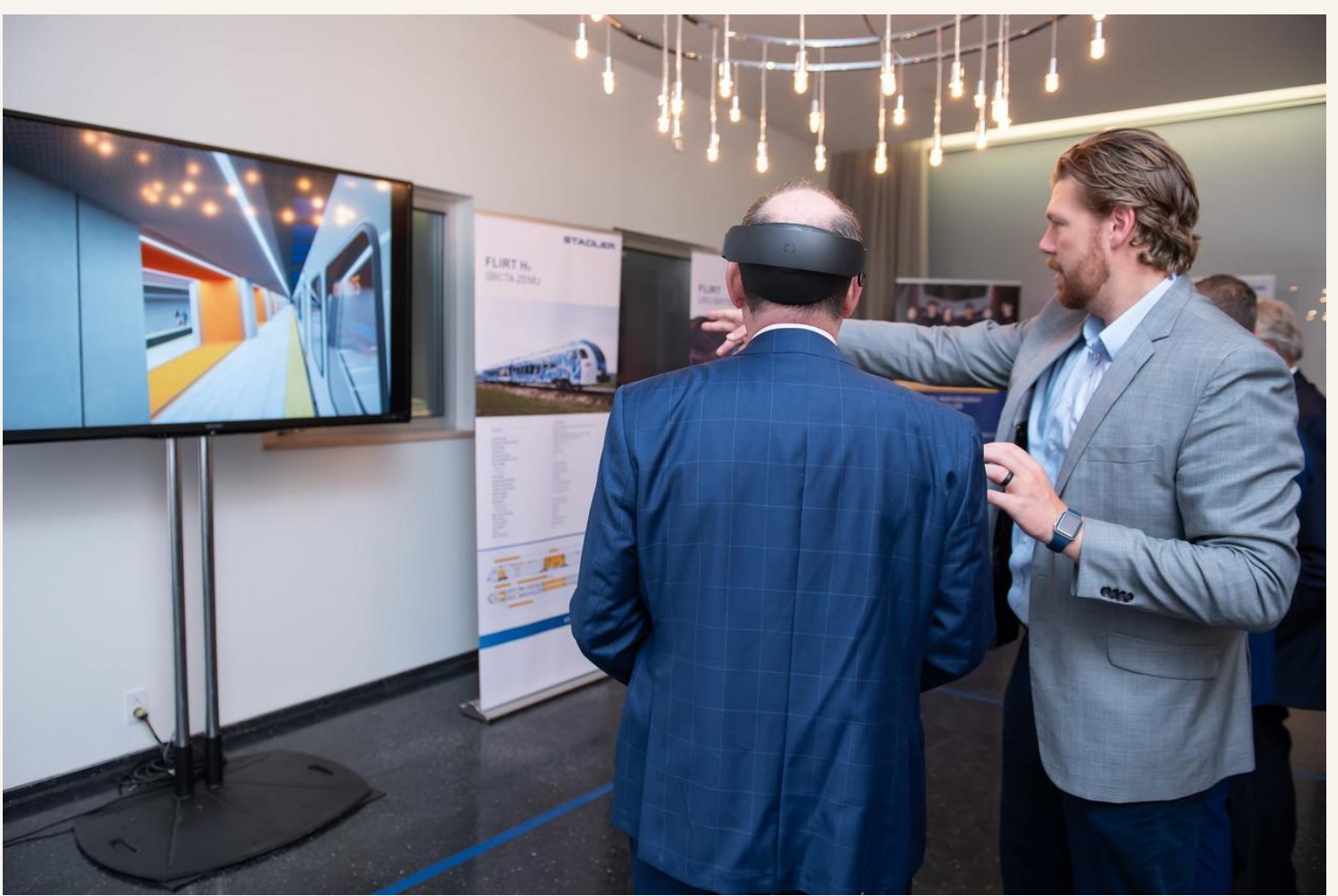
Guests explored a groundbreaking new transit system in virtual reality with Stadler Rail.