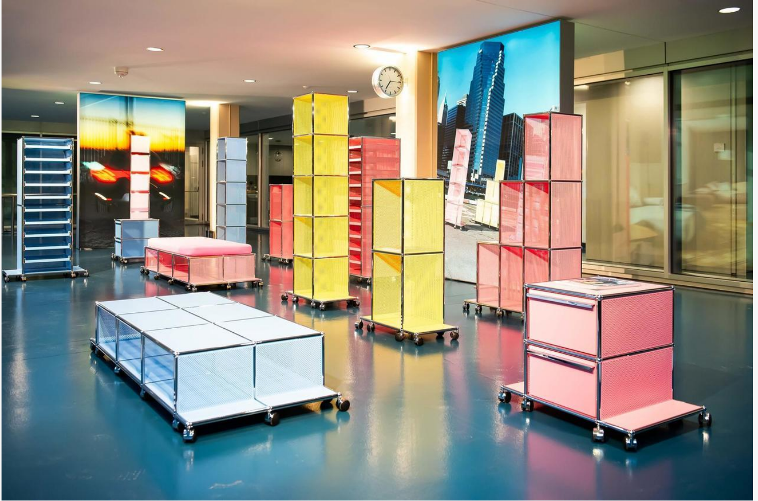
A timeless classic in new shapes and colors: Ben Ganz's limited edition USM Modular Furniture collection.

Switzerland is not only known for its attention to detail and craftsmanship in industry; since the 1950s, Swiss design has become a beacon of minimalistic and sophisticated style. USM Modular Furniture serves as an excellent illustration of modern Swiss aesthetic sensibilities.