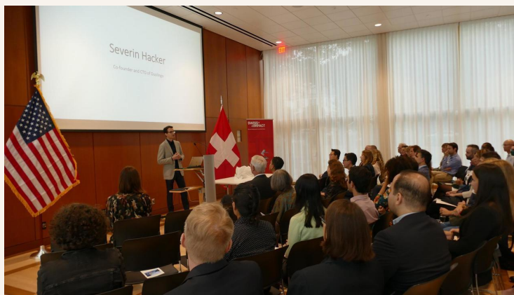
Group visit at the Central Maryland Research and Education Center Headquarters.