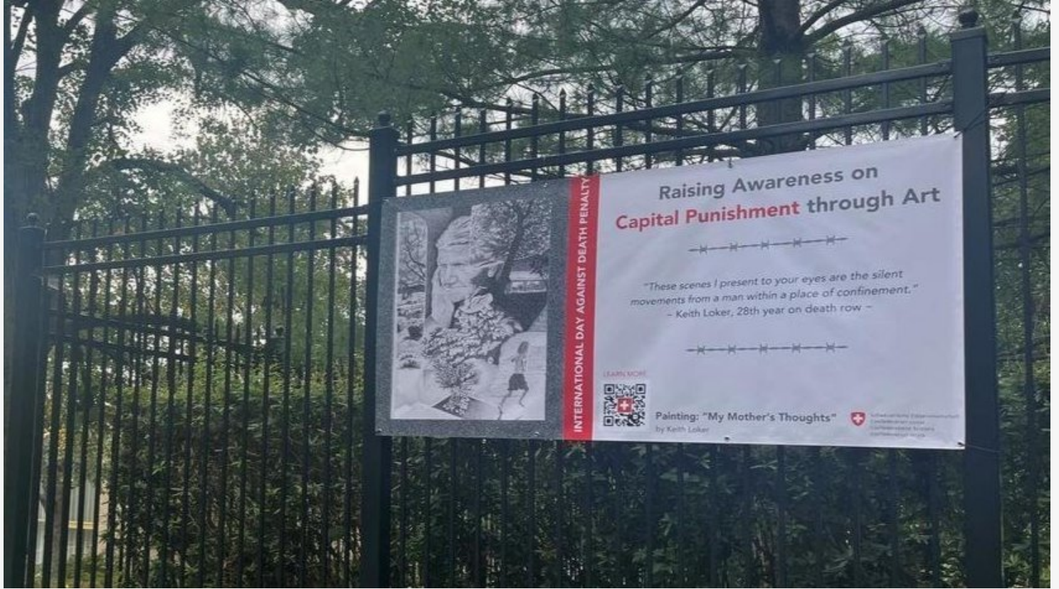
Artwork displayed on the Embassy's fence to raise awareness about capital punishment.