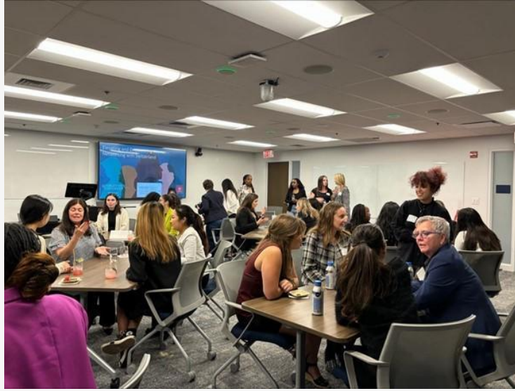
Students and women leaders engaged in a speed-networking session at the CALL.