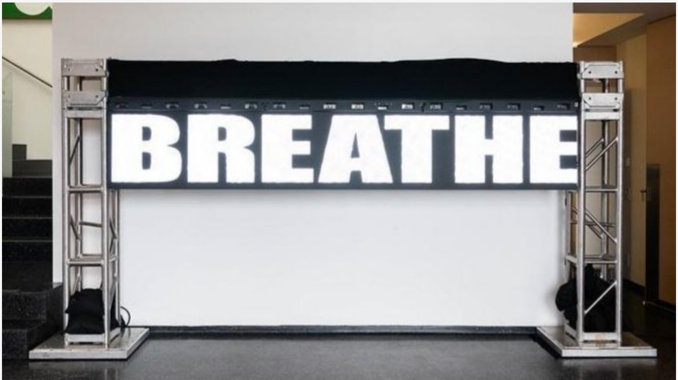
Khalil Berro's installation sheds light on the air we breathe.

The Swiss Polar Institute (SPI) plays a crucial role in advancing polar and alpine research by fostering collaboration among scientists, institutions, and nations. SPI focuses on both the Arctic and Antarctic regions, organizing field expeditions, facilitating data collection, and promoting international cooperation. Through its innovative projects, SPI contributes to our understanding of climate change and the various ecosystems in these extreme environments.