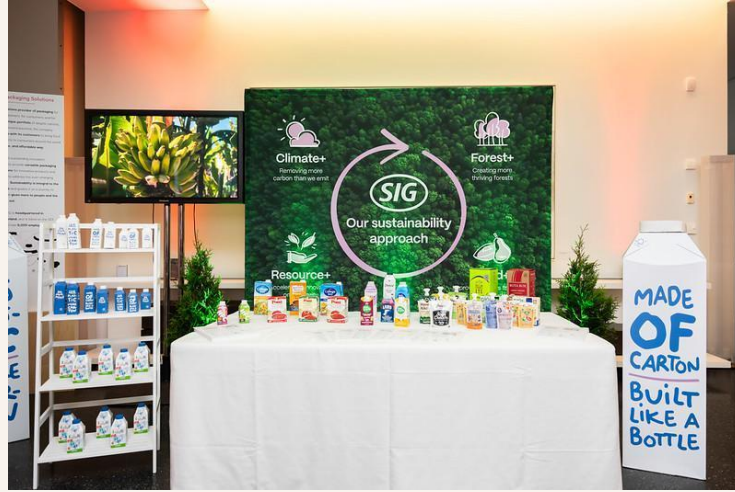
ABB's activation promoted wildfire prevention, while SIG presented its sustainable packaging solutions.