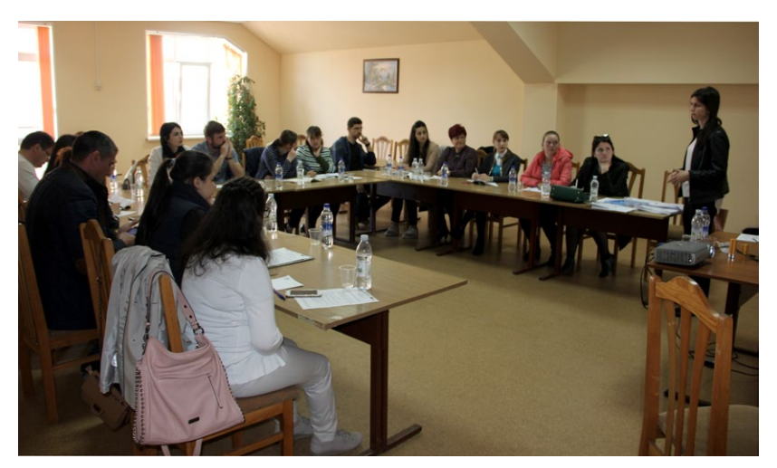
People in three districts (Soroca, Causeni and Cahul) learn how to get access to information of public interest and ensure administrative transparency at local and district levels.

The Engaging Citizens and Empowering Communities project aims to strengthen civil society organisations by enabling them to play a crucial role in promoting and safeguarding the rights and interests of vulnerable and marginalised people in Moldova.