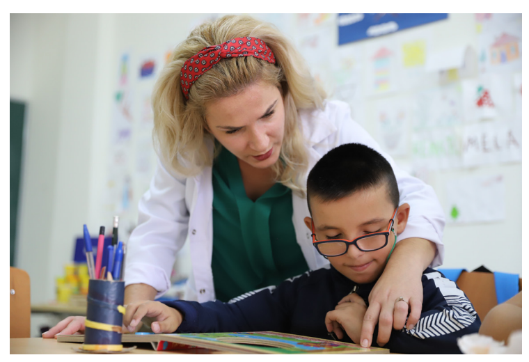
Children and young people with disabilities in 23 municipalities are receiving upgraded social services.

Citizens, including the most vulnerable, influence agenda setting and decision-making through engagement as individuals, interest groups, movements or organised civil society at the local and national levels. Civil society has a strong voice on social, economic and environmental issues (including climate change), and proposes solutions through constructive dialogue with public institutions. Civil society also promotes accountability, transparency and trust within society; embraces internal innovation; and advocates for the responsible and inclusive digitalisation of society.