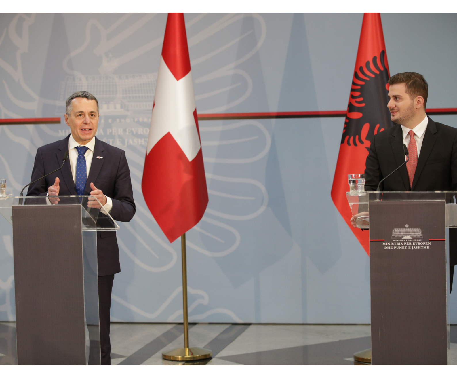
Federal\ Councillor\ Ignazio\ Cassis\ addresses\ the\ media\ during\ his\ visit\ in\ Albania\ in\ November\ 2020.