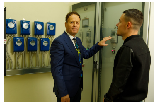
A modernisation of water utilities goes hand in hand with building institutional capacities and strengthening their management.

Some important lessons learnt are as follows: (i) key institutions still have limited skills and capacities in areas such as disaster risk reduction (DRR), to implement policy and legal frameworks; (ii) services improve sustainably only when individual and institutional capacities are strengthened in public utilities and municipalities, and citizens' awareness is increased; (iii) joint interventions with other development partners at all levels produce more tangible and sustainable results and are better able to mitigate external risk factors; (iv) the performance-based approach has demonstrated good results, and is supported by the GoA and major development partners; and (v) social inclusion of low-income/vulnerable groups requires targeted measures on several levels.