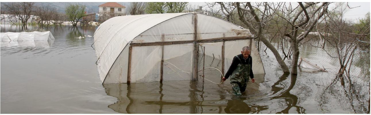
Flooding has disrupted Albania's lowlands several times in the past few years.

The GoA's commitment to achieving energy security and efficiency with reduced greenhouse gas emissions requires cost-efficient investment in wind and solar power as well as economically and environmentally sound investment in hydropower. Energy projects in the Vjosa River system must comply with international and EU norms with respect to impact assessment and environmental protection. Since the Vjosa is Europe's last wild river, protecting its biodiversity is an issue of international importance. Civil society is actively calling for transparency and consultation procedures.