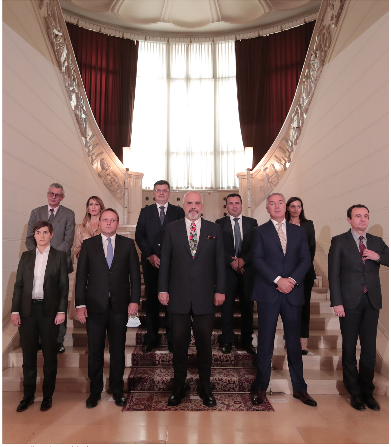
Western Balkans Six Summit in Tirana, June 2021.

Albania engages in regional initiatives and has stable relations with neighbouring countries, despite some issues, such as its maritime borders with Greece. Geopolitical dynamics in Albania and the Western Balkans region involve a Chinese, Russian, Turkish and Arab presence, which challenges the Euro-Atlantic influence to some extent.