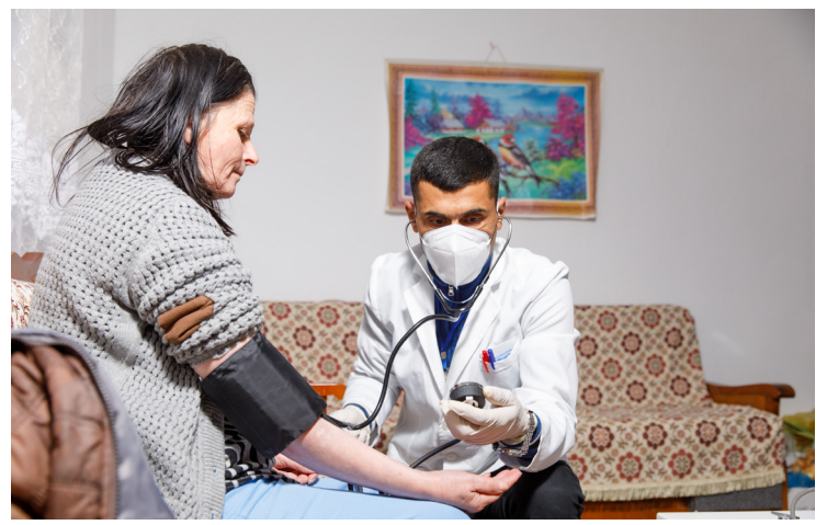
Nurse trained with Swiss support providing home care for patient in remote village of Dibër prefecture.

Children and adolescents will adopt healthier behaviour and become more aware of the impacts of climate change and the environment on health, with support from their communities and municipalities. The critical situation of health workers will improve, thanks to clear policies on human resources and if possible engagement with the diaspora. National public institutions considered to be drivers of change will receive support in providing decentralised and inclusive health services, particularly for emergencies. Digital health opportunities will receive systematic support, with emphasis on context-relevant practices (such as home-based care models, e-consultation and health promotion) and on improved access and inclusion for the most vulnerable (e.g. the elderly, the Roma community and women). Mental health will be addressed across all interventions.