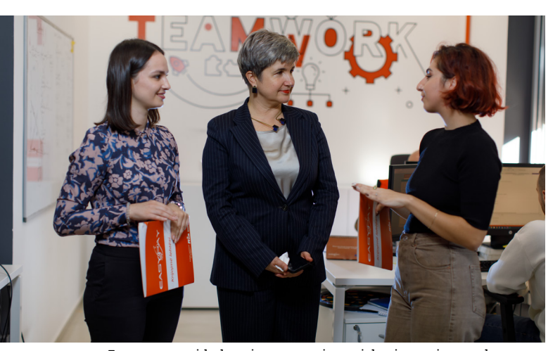
Engagement with the private sector is crucial to improving youth employment in Albania.

Switzerland will further work to promote reforms and an innovation-friendly business environment to increase competitiveness, productivity and investments in an environmentally sustainable manner. SECO and the SDC will work complementarily with public and private sector partners to accelerate reforms and to trigger private sector growth, climate-friendly investment and the creation of decent jobs. Central to this support will be efforts to improve entrepreneurs' access to resources – including finance, know-how and technology – and market diversification, as well as to facilitate compliance of businesses with regulations and quality standards. Swiss cooperation will focus particularly on strengthening dialogue between the government and private sector, which is essential for building trust amongst citizens and businesses. Building on and scaling up from past experiences will facilitate systemic change, while recognising the critical need for sustainable economic development.