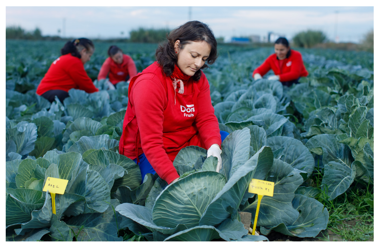
An increase in Albania's exports should be coupled with the establishment of international and European quality standards in order to ensure competitiveness and integration.

Some important lessons learnt are as follows: (i) despite significant progress, additional efforts are needed to strengthen macro-economic consolidation and resilience, especially in PFM, for resource mobilisation and effective use of public funds; (ii) the business environment needs further improvement to strengthen competitiveness (particularly of SMEs and start-ups) and regional economic linkages, and to ensure private sector participation with regard to reforms in economic policymaking, bearing in mind the importance of the informal economy; and (iii) a stronger focus on creating decent jobs and further efforts are needed to strengthen institutional arrangements for developing market-oriented skills and job intermediation services.