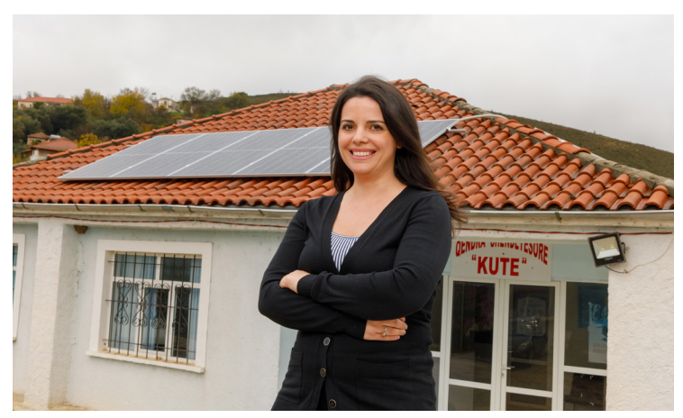
Renewable and alternative energy sources are gradually making way into Albania's energy system.

Switzerland will support national and local authorities in addressing climate change and its effects. With Swiss support, partners will be able to manage natural resources sustainably, particularly through more efficient energy use and diversification of renewable energy sources, which are important steps towards mitigating climate change. In addition, Switzerland will increase its efforts to strengthen human resource capacities, improve policy and institutional frameworks, and introduce innovative measures for adaptation to climate change impacts. New interventions are planned (SECO) or being assessed (SDC) with national and local authorities to help municipalities and communities becoming more resilient in the face of climate change and natural/environmental hazards.