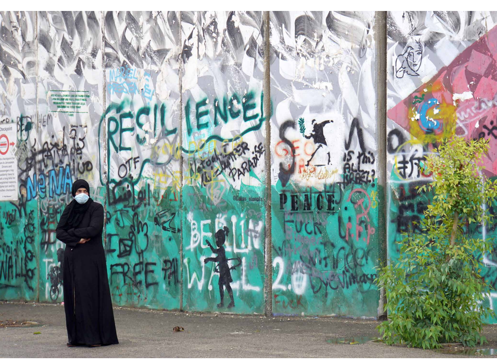
Resilience\ and\ longing\ for\ peace-scene\ at\ a\ bus\ stop\ in\ Bethlehem.\ Courtesy:\ Thomas\ Jenatsch