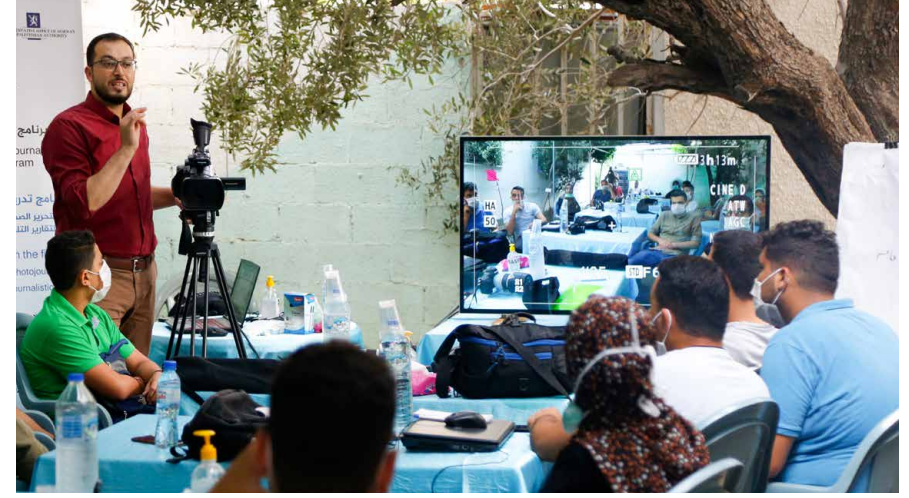
Training course for young journalists in the frame of the project "Strengthening Free & Independent Media in Palestine" co-funded by the Swiss Government.