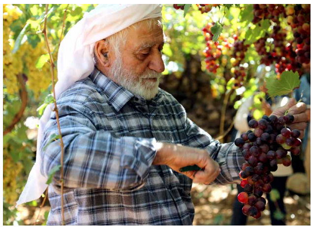
Switzerland promotes support and technical innovation for smallholders – a contribution to foster food security and access to land in the oPt.

In line with the peace promotion strategy of the Human Security Division (PHRD) for Israel and the oPt, Switzerland has contributed to inclusive dialogue, both within the Israeli and Palestinian societies, as well as between them. Through diplomatic and programmatic engagement, it has encouraged innovative approaches to addressing the conflict and contributed to de-escalating tensions. For example, Switzerland co-mediated a ceasefire agreement between Israel and Hamas in November 2018. In 2017, Switzerland negotiated the elaboration of a document (the Swiss roadmap) between Palestinian factions that laid the ground for a consolidation of the civil service in the Gaza Strip.