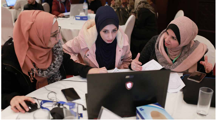
Youth brainstorming at a "hackathon" (software development event) in Gaza sponsored by the SDC and UNDP job creation program.