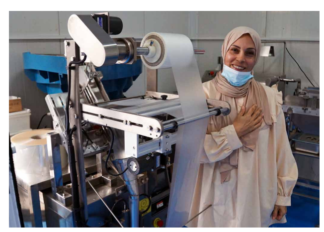
This Palestinian businesswoman expanded her family enterprise thanks to a new packing system for dates, purchased with Swiss support.

In order to achieve its objectives, Switzerland will explore new fields of cooperation by venturing into new themes (innovation, job opportunities), establishing new partnerships (research, private sector where possible) and by bringing in Swiss expertise, while continuing its engagement for a just and sustainable solution to the conflict.