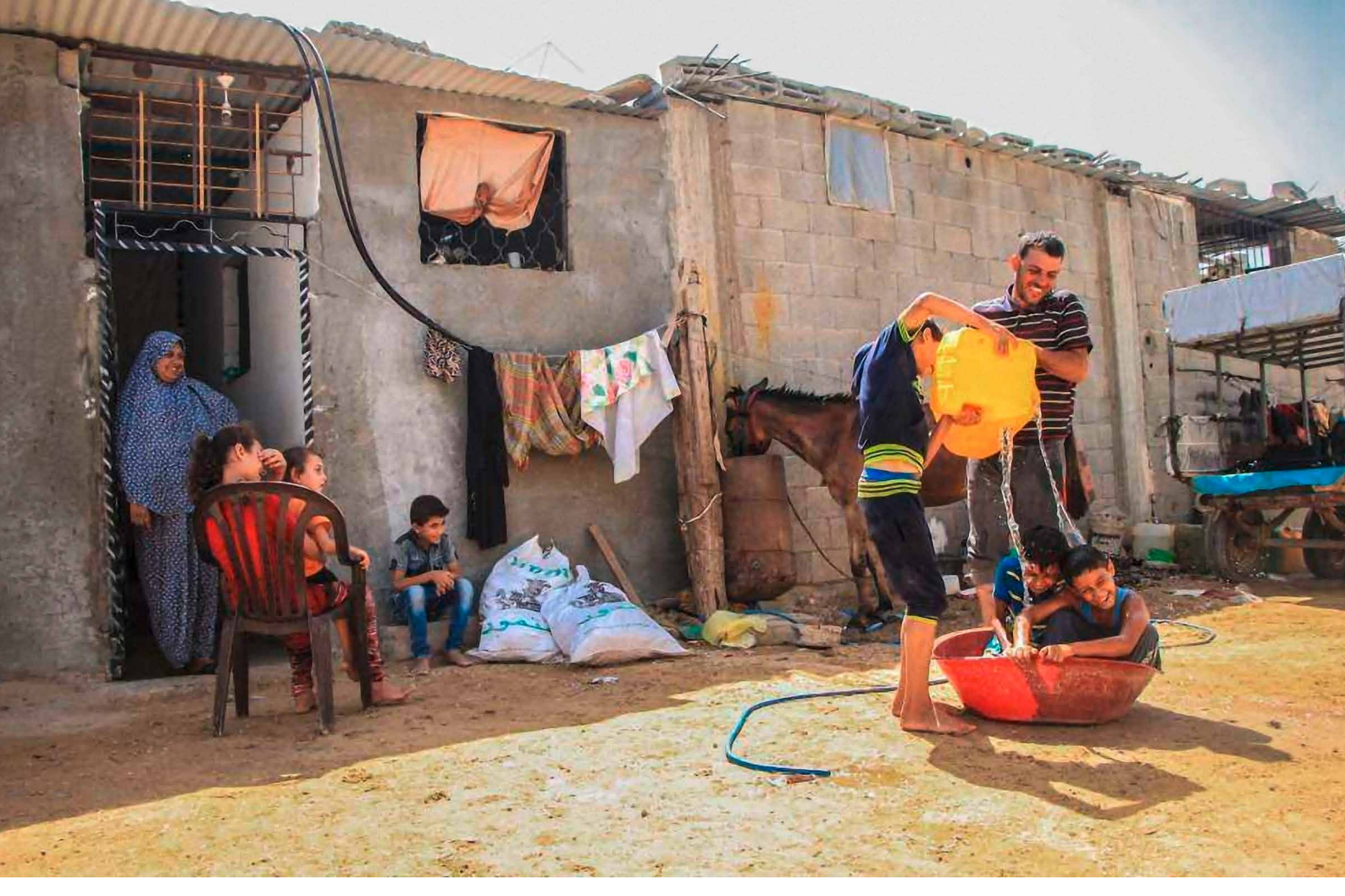
Family life in the Gaza strip. Only one in 10 people has direct access to clean and safe water while 97% of freshwater from Gaza's aquifer is unfit for human consumption.