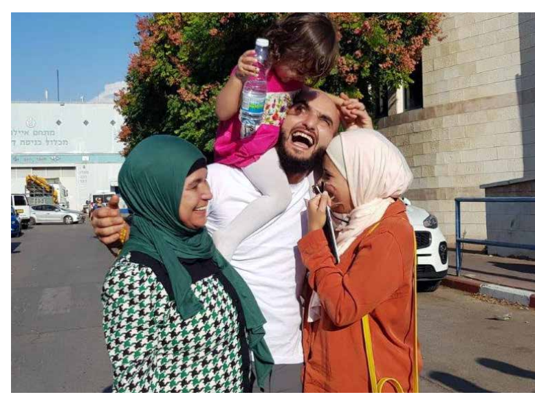
The promotion of peace, human rights and international humanitarian law is a central pillar of Swiss engagement in the oPt and Israel. A Palestinian released from administrative detention in Israel is greeted by his family.

In general terms, young people in the oPt are politically underrepresented and no participation mechanisms are in place to enable them to accede to leadership positions. Unemployment remains high, particularly in the Gaza Strip – reaching about 50% among the general population and 70% among youth (aged 15 to 29) and 92% among young women<sup>9</sup>. Palestinian youth are increasingly disillusioned and there is a risk that frustration will be expressed through violence or emigration. Within the existing constraints, including trade barriers, opportunities exist: well-educated and skilled Palestinian youth can be engaged in and generate jobs in the emerging high-tech and IT sectors. In the medium term, and if circumstances allow, there will be additional opportunities linked to the regional economy, for example in the digitalisation sector.