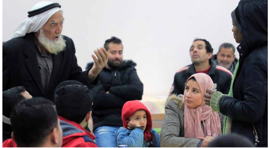
Debate between members of a community on future projects for their village.