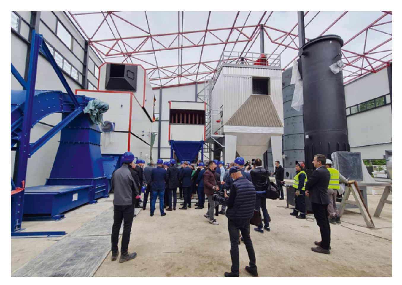
New biomass fuel plant in Priboj, which will contribute to the increase in use of renewable energy sources in Serbia to reduce pollution. Project 'Renewable Energy for District Heating Programme in Serbia'