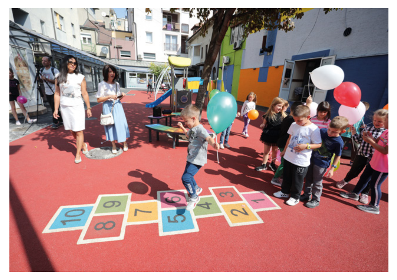
The playground for children in Uzice, equipped with funds that were received as the National Annual Award for Best Practices in Applying Good Governance Principles at the Local Level, established under the Swiss PRO project.

In the 'Sustainable Energy and Resilient Cities' domain the current portfolio can be further built on, making use of an improving context (various energy and climate relevant laws recently adopted) and increasing policy drive and citizen awareness for environmental and climate related topics. The Swiss portfolio will continue to support the green energy transition by increasing energy efficiency and the share of renewable energy sources. In disaster risk reduction and urban development (resilience of cities), new programmes have just started or are about to start. While climate mitigation and resilience of cities will remain in focus, there is scope to tackle climate change (mainly adaptation) in a more comprehensive way, for which complementary entry points to the existing portfolio still need to be explored.