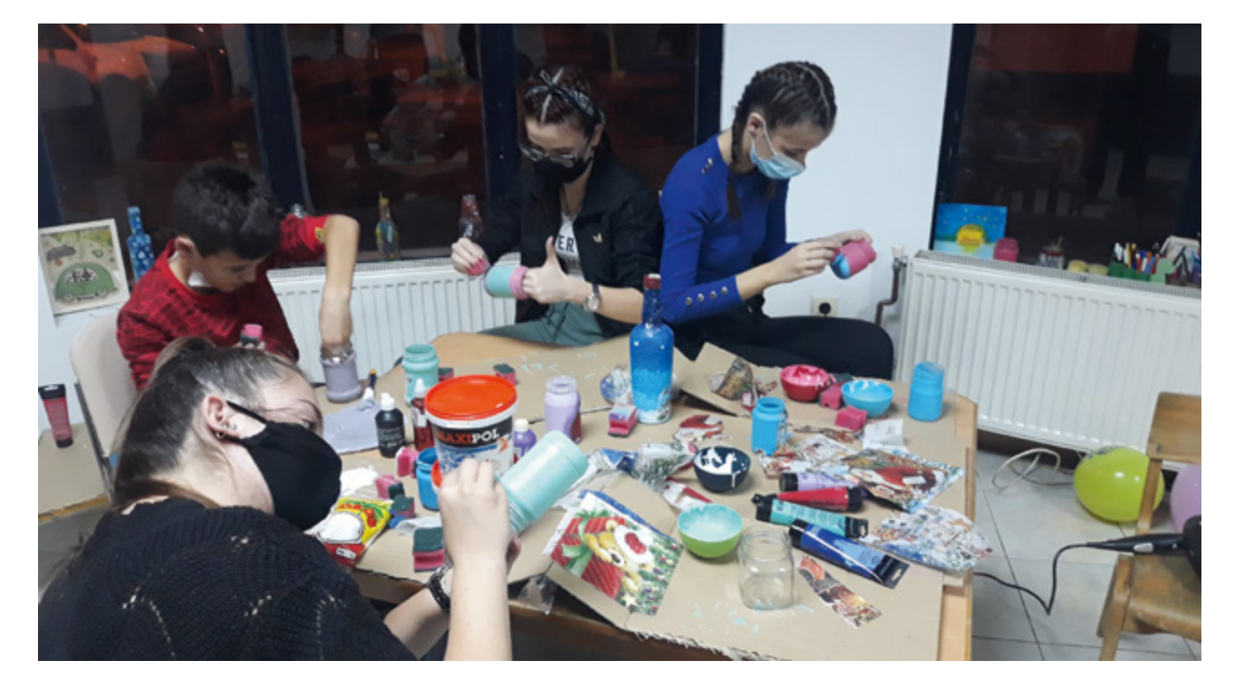
Inclusive workshop organised by the NGO Bazi Mili from Lajkovac. Project 'For an Active Civil Society Together – ACT'

The strategic orientation of the cooperation programme 2022-25 builds on the following current trends: the government will maintain its aspiration for European integration and keep a strong focus on maintaining macro-economic stability, economic recovery and development after the COVID-19 pandemic. This offers possibilities to continue and deepen cooperation around shared values and joint objectives in macro-economic support, private sector development, trade and vocational education for more decent and better paid jobs. The concentration of political power will continue, offering limited space to work towards a more pluralistic polity and strengthening the rule of law. In spite of increasing inequalities, exacerbated by the COVID-19 pandemic, the topic of social inclusion is not at the top of the government's agenda. This situation calls for a certain rebalancing of the current governance portfolio, giving more