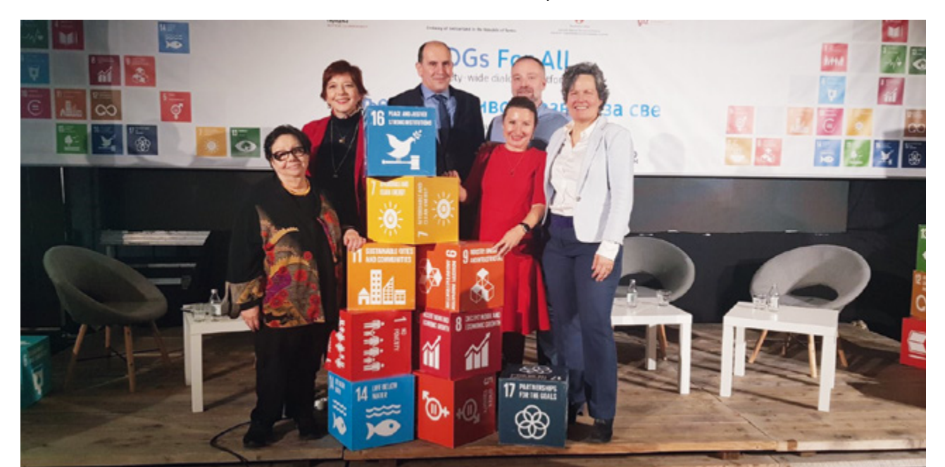
Launching event SDGs dialogue platform – CSO pillar moderators for three dimensions of sustainability: economic, social and environmental. Project 'SDGs4All'

It is thus in Switzerland's own interest to contribute to the stability and prosperity of Serbia through the joint commitment of three Swiss ministries: the Federal Department of Foreign Affairs, represented by the Directorate of Political Affairs (DP) and the Swiss Agency for Development and Cooperation (SDC); the Federal Department of Economic Affairs, Education and Research, represented by the State Secretariat for Economic Affairs (SECO); and the Federal Department of Justice and Police, represented by the State Secretariat for Migration (SEM), acting within the Swiss Migration Strategic Framework for the Western Balkans 2020–23. All Swiss state actors cooperating with Serbia, based on their various mandates, contribute to the common goal laid out in this cooperation programme.