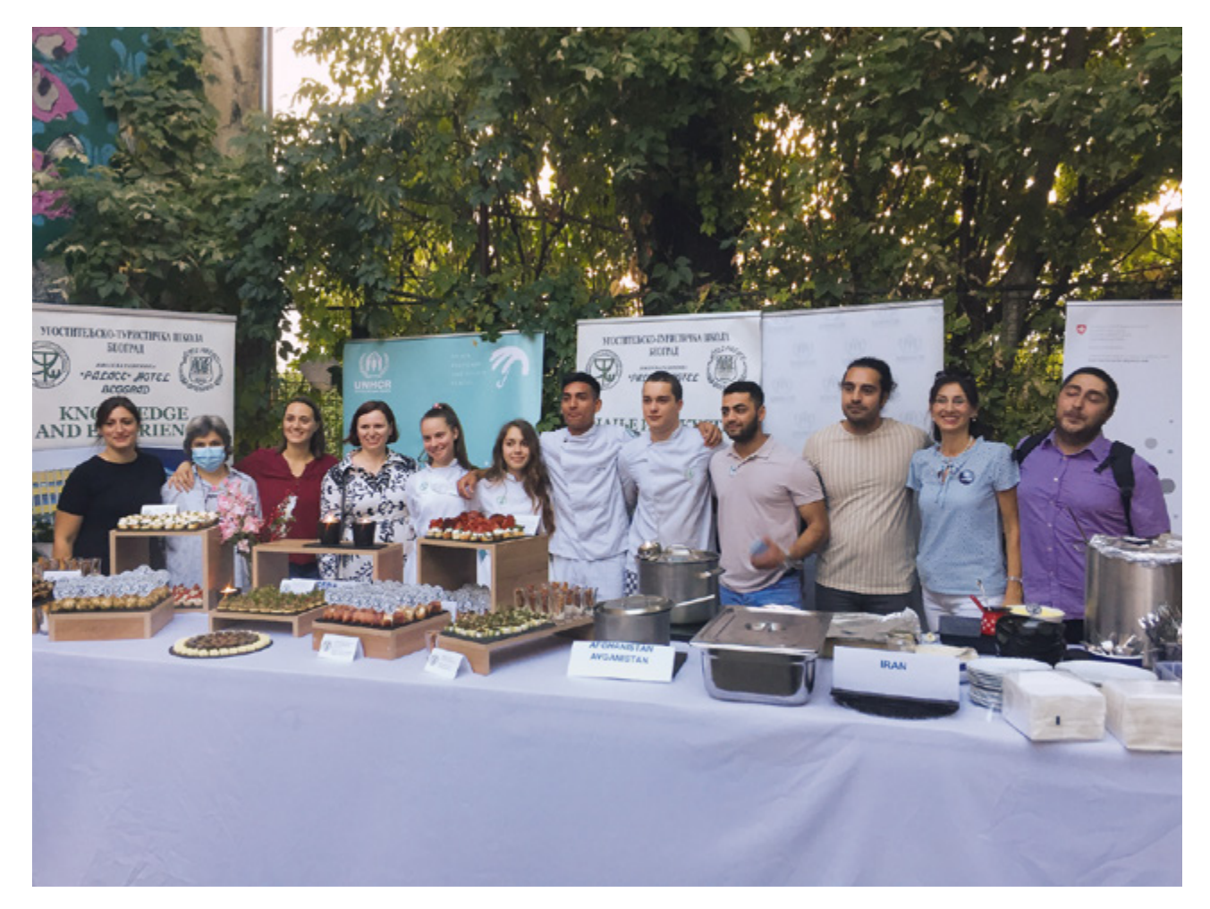
Deli Monday, an event where guests can try specialities from different cultures and cuisines, exchange experiences and socialise. Project 'Mixed migration and Protection/Integration system support'