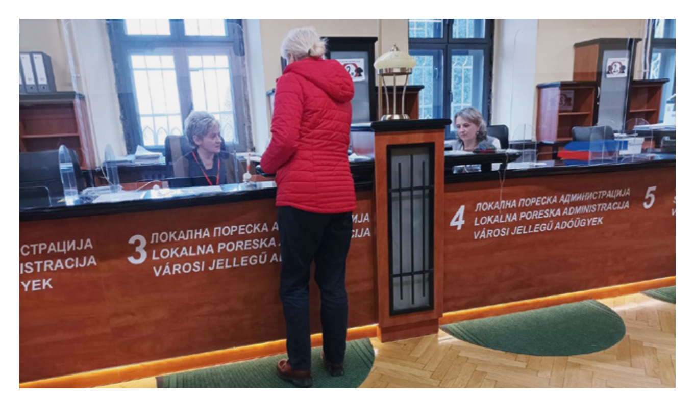
Local tax administration City of Sombor – citizen register their property assets which are subject to property tax. Project 'Municipal Economic Development in Eastern Serbia' Phase 2

emphasis to local social service delivery and citizen-centred processes, and participation in sub-national decision-making, as well as mainstreaming governance throughout the portfolio. For climate change related action, there seems to be a positive momentum. Recently adopted laws, increasing political will and awareness in a broader public, offer an opportunity to deepen cooperation for both mitigation and adaptation measures.