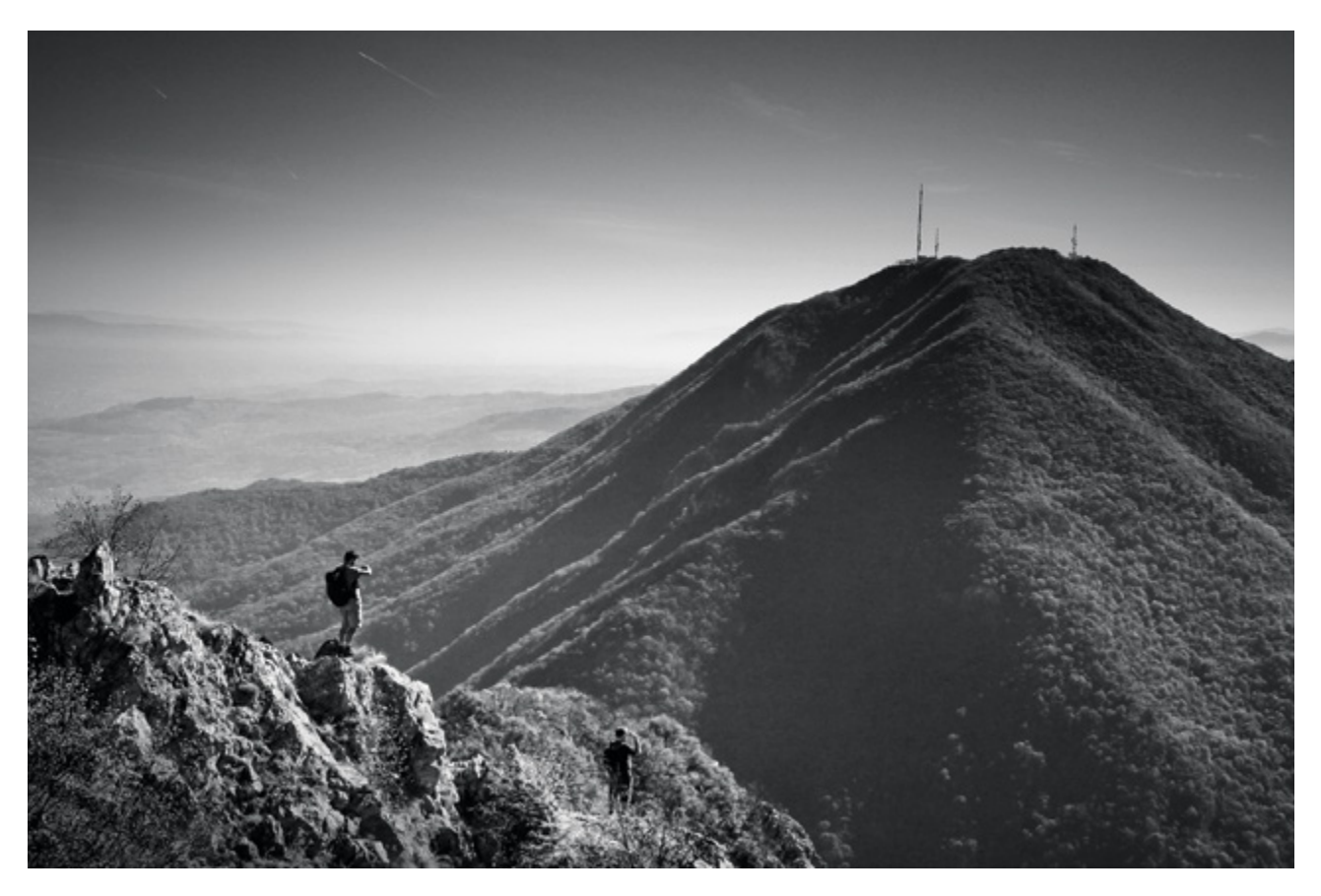
A view on Mountain Ovcar from Mountain Kablar, Ovcarsko-kablarska klisura.