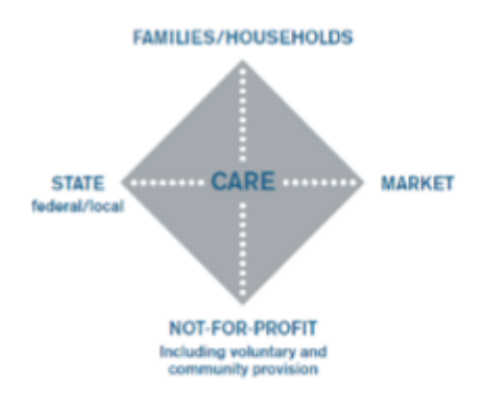
Figure 1: Care diamond

A way to address and incorporate unpaid care work into development projects and programmes is to categorise according along the Triples R framework , as follows. Note that these are not sequential but rather mutually reinforcing .