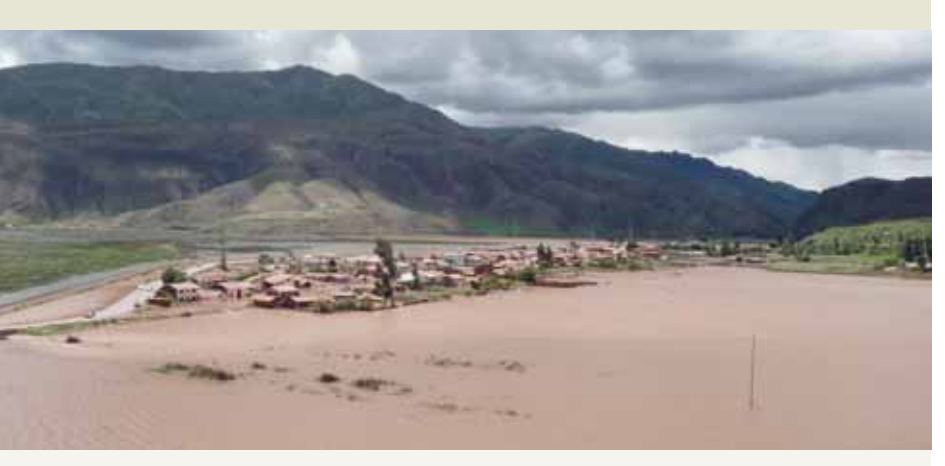
A village flooded in February 2010. Location: Huacarpay, near Cusco, Perú

Both Peru and Bolivia are increasing efforts to address these recurrent disasters and to implement the HFA, mainly through policy dialogue, the improvement of risk governance and by making territorial and investment planning disaster resilient.