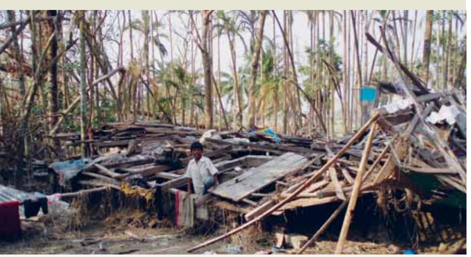
Part of a village destroyed by cyclone Sidr. Location: Upazila Sarankhola, Rayenda Union, Bangladesh.

Changing weather patterns, widespread poverty and its location in a huge delta puts Bangladesh at risk from multiple hazards, including cyclones, floods, droughts, earthquakes, tornados and riverbank erosion. An extreme population density (with a record 1,100 persons per km²) and extreme poverty render the population highly vulnerable to the forces of nature. Against this background, the Bangladesh government is pursuing a shift towards a comprehensive culture of risk reduction as outlined in its National Plan for Disaster Management (2007-2015). In the aftermath of cyclone Sidr in October 2007, the SDC initiated a recovery programme in Bangladesh. The "Community-based DRR Programme in cyclone Sidr affected areas" (CB-DRR) is particularly interesting in this context.