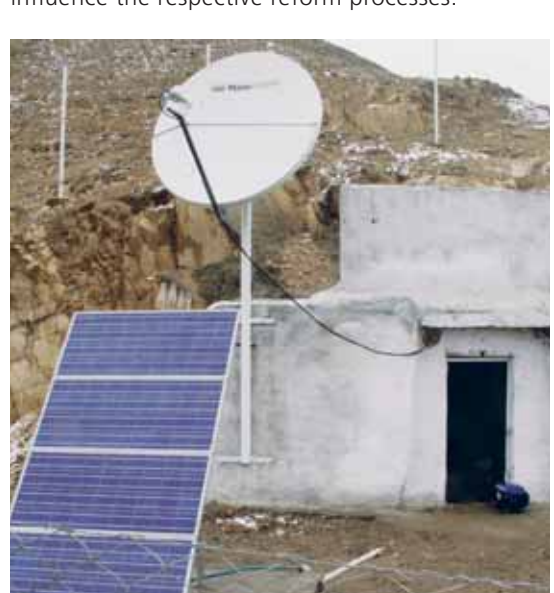
A seismic monitoring station with broadband satellite connection Location: Shartuuz, Tajikistan

upstream from the existing Nurek Dam). However, future risks of failure of these investments are considerably reduced if the structures are built in a way that takes the prevailing seismic conditions into account. Further support for intensified mapping campaigns (standards, methods, finances) is necessary to underscore the aforementioned effects. Only technically sound information in this field will influence the respective reform processes.