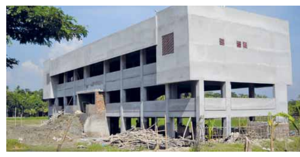
A shelter under construction with SDC support. Location: Hogolpati, Bangladesh