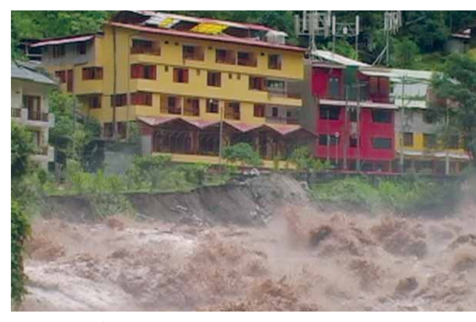
High-cost tourism infrastructure exposed to a mountain torrent Location: Aguas Calientes near Cusco, Perú. Photo credit: La Republica, February 2010

The integrative disaster risk management approach adopted by the project for the promotion of riskconscious planning, the disaster proofing of investments and better preparedness will lead to a significant reduction of disaster losses. Taking the USD 200 million of damage from the early 2010 floods as a typical example of a disaster with a five to ten-year return period, it may be assumed that the adoption of good DRR practices at all levels will reduce such damage by between 5-10% (= USD 10 to 20 million every five to ten years) and corresponds to an annual risk reduction of between USD 1 and 4 million. This rough estimate attributes high (cost-)effectiveness to the initiative, in particular for transport, education and healthcare infrastructure and agriculture. These investments will be more resilient to the next disasters.