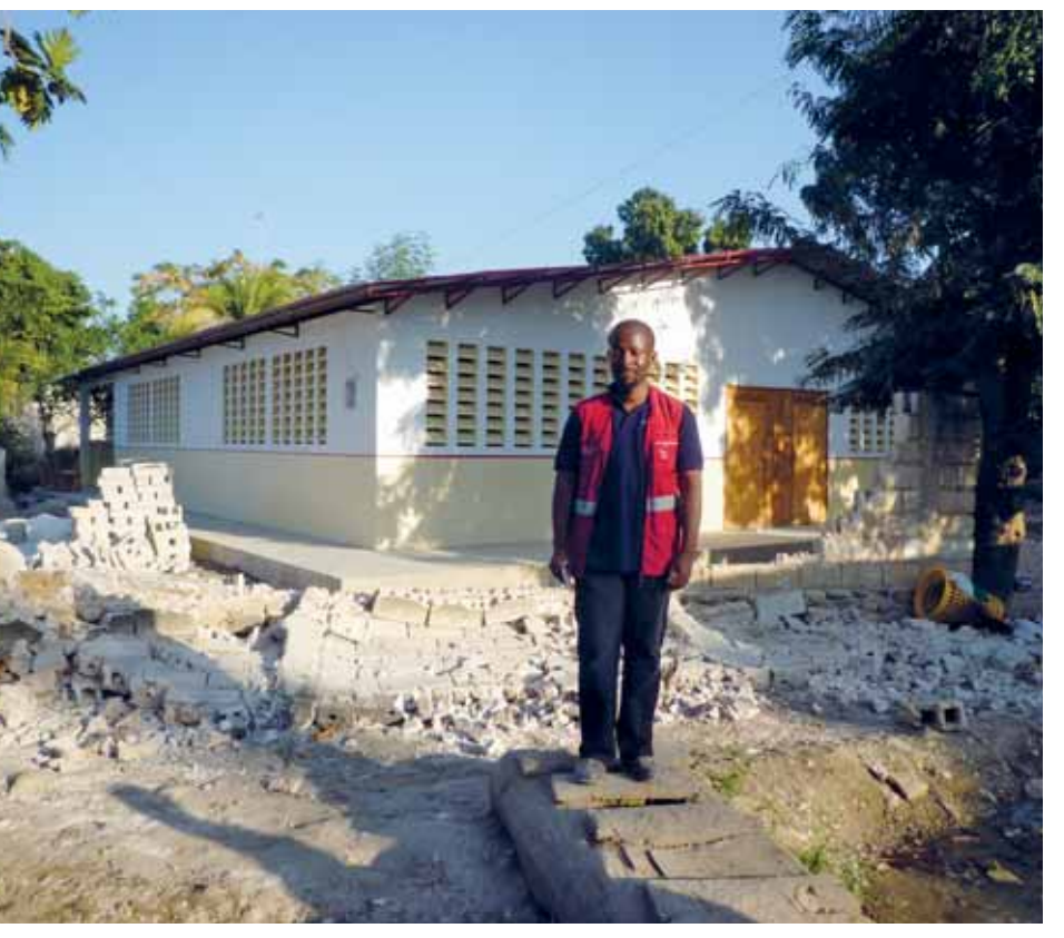
Despite its location approximately 10 km north of the epicentre, this recently renovated school building only suffered minimal damage in the earthquake. A UN assessment team estimated that between 40-50% of the buildings in Gressier were destroyed. Location: Gressier, Haiti, on 17 January 2010