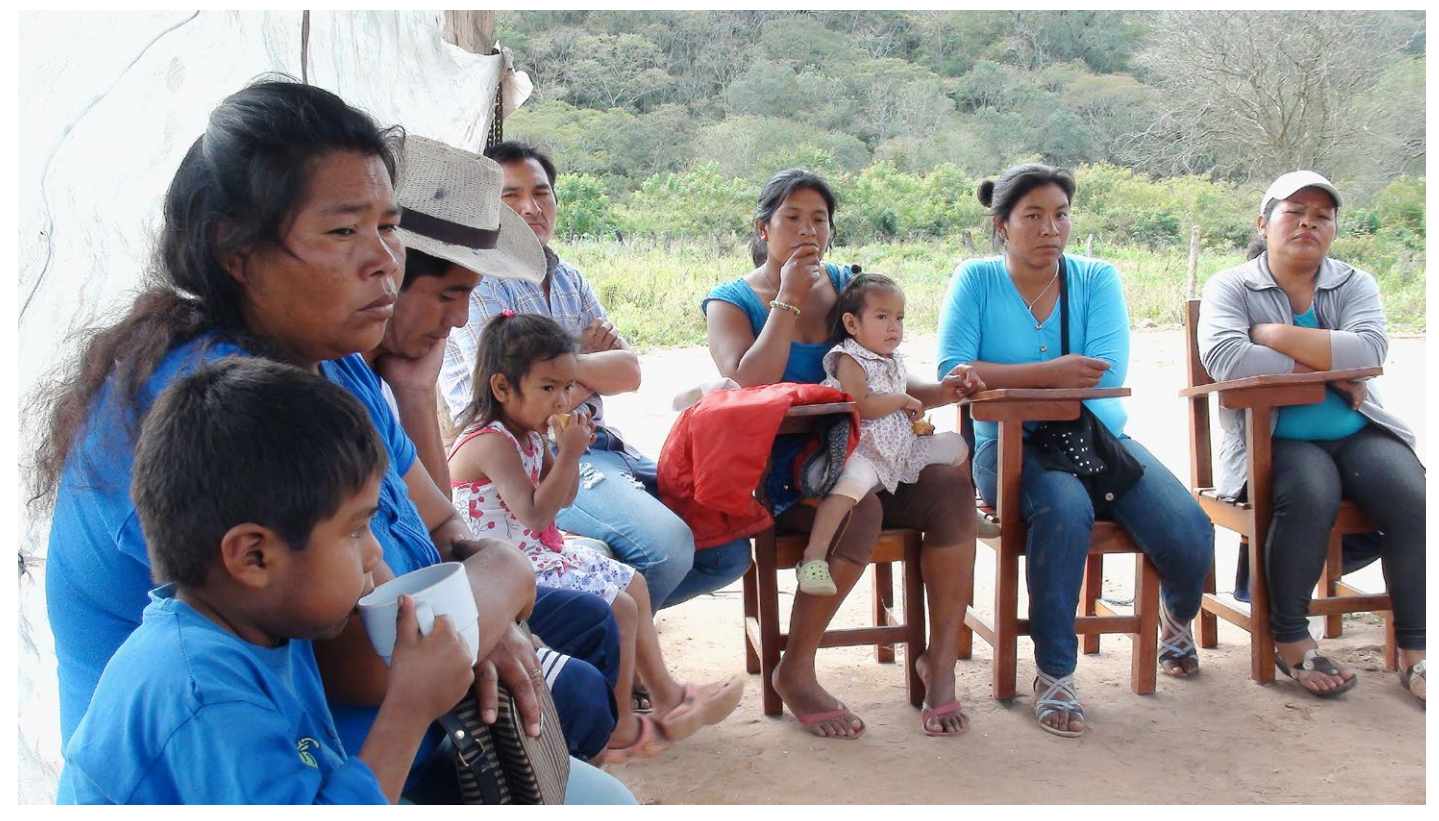
More beans, better health: a Guarani community meeting about bean consumption.

Now that the project is finished, the SDC is making all the knowledge it has acquired about bean cultivation available to the National Agriculture and Forestry Innovation Institute (INIAF). This knowledge includes how best to promote bean cultivation in different ecological settings and production conditions, and how to organise bean growers and expand the areas under cultivation. It is hoped that INIAF will continue to work with El Vallecito and that El Vallecito will use its own resources and the support of other financial backers to keep sending its seeds and 'bean guys' to rural areas.