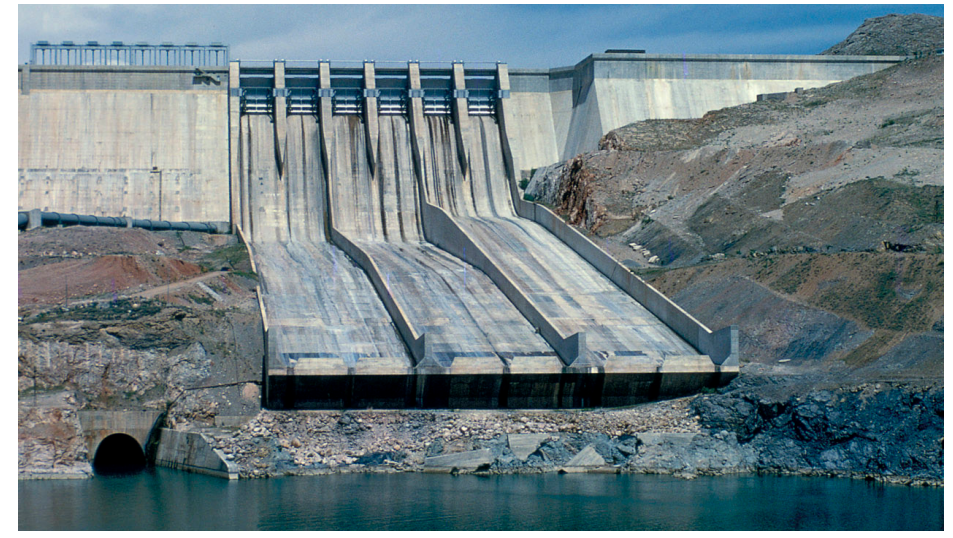
The Keban Dam on the Euphrates in Turkey.

Peace diplomacy is not restricted to the Middle East. The SFG has produced a second report with Swiss support, published in February 2013, applying the same working methods to the Nile Basin. Other countries have expressed an interest. Ultimately, these first experiences should lead to a global Blue Peace model which can be applied on a large scale.