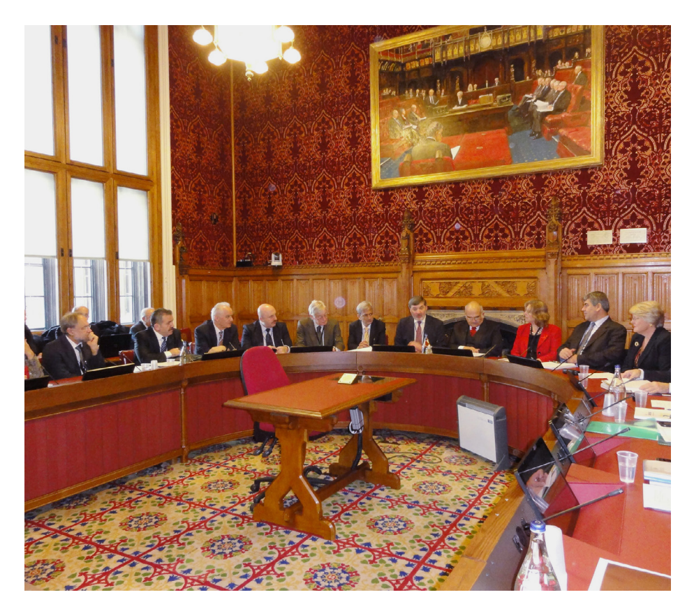
The Blue Peace initiative awakens interest. Political leaders of the high-level forum and the FDFA meet, on invitation, at the House of Lords in November 2012.