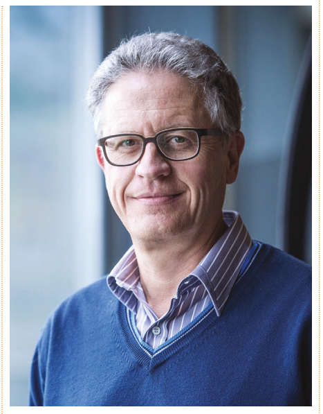
«It will always be the most vulnerable in each society who are affected the most».

The issue concerns all countries of the world and changes the traditional north-south relations in multilateral work. What is going to happen?