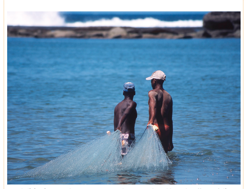
People living in coastal areas are among the most vulnerable to the effects of climate change, like here in Mozambique.

ANALYSIS The strategy to tackle global warming includes both mitigation to limit its extent and adaptation to deal with its effects, which are already being felt — in other words, smart development.