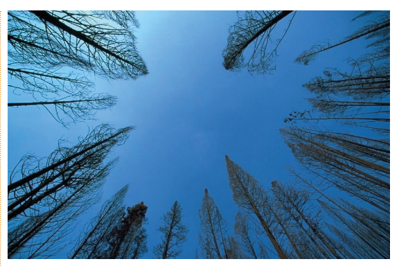
Curbing global warming will require financial commitment and political will.

We are a long way from that. Total climate-related financial flows in 2013 came to USD 331 billion, down from USD 359 billion in 2012. This amount includes all transactions, from every country and of every kind, including both public and private-sector funds. The latter account for some 58% of the total. A diagram of these financial flows would look like a map of the switches at a rather large railway station. The research centre that publishes these figures, the Climate Policy Initiative, is quick to point out that they do not tell the whole story. The decrease is due mainly to the fall in the cost of renewable energy, especially of solar systems. Moreover, the experts note, in addition to activities that exclusively target the climate there are others with beneficial collateral effects that are difficult to quantify. To further muddy the waters, some of these investments over- DANIEL BIRCHMEIER lap, making them difficult to track.