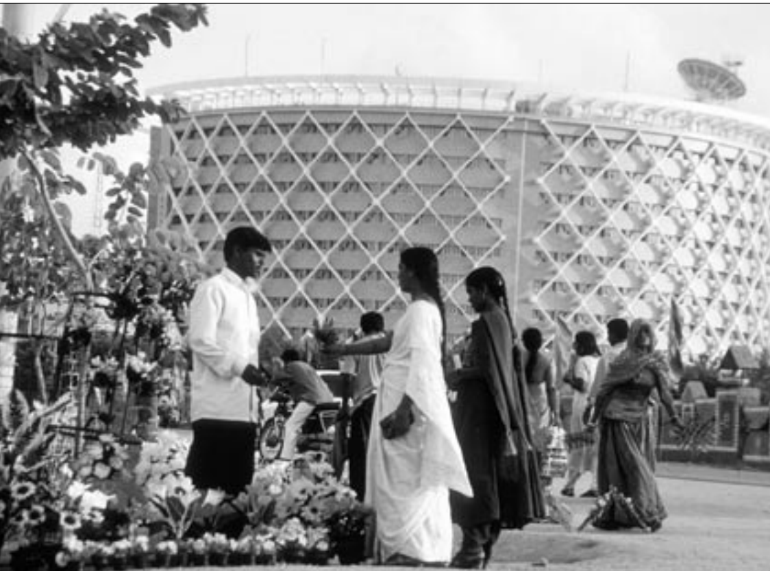
The High-Tech City in Hyderabad (India) symbolises the hope for ICT-led job creation and growth.

Empirical evidence on the fast developing modern ICTs, the Internet, however, is still quite limited, leading us to speak of an "interim" assessment.