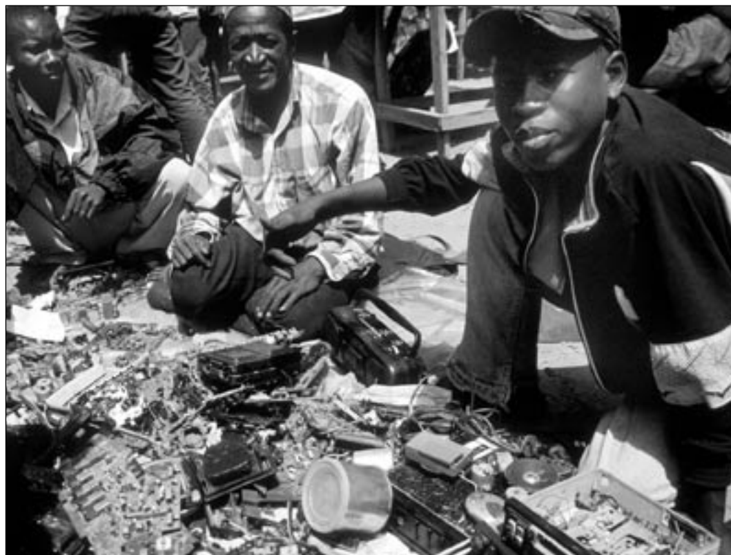
Thousands of second hand spare parts for radios can be found on many markets as in Nampula (Mozambique)

Since all this progress was much stronger in developed countries, ICTs are accelerating the differences, which are felt by rich and poor alike, opening up the “digital divide”. “ICTs disparities usually exacerbate existing disparities based on location (such as urban – rural), gender, ethnicity, physical disability, age, and, especially income level and between “rich” and “poor”