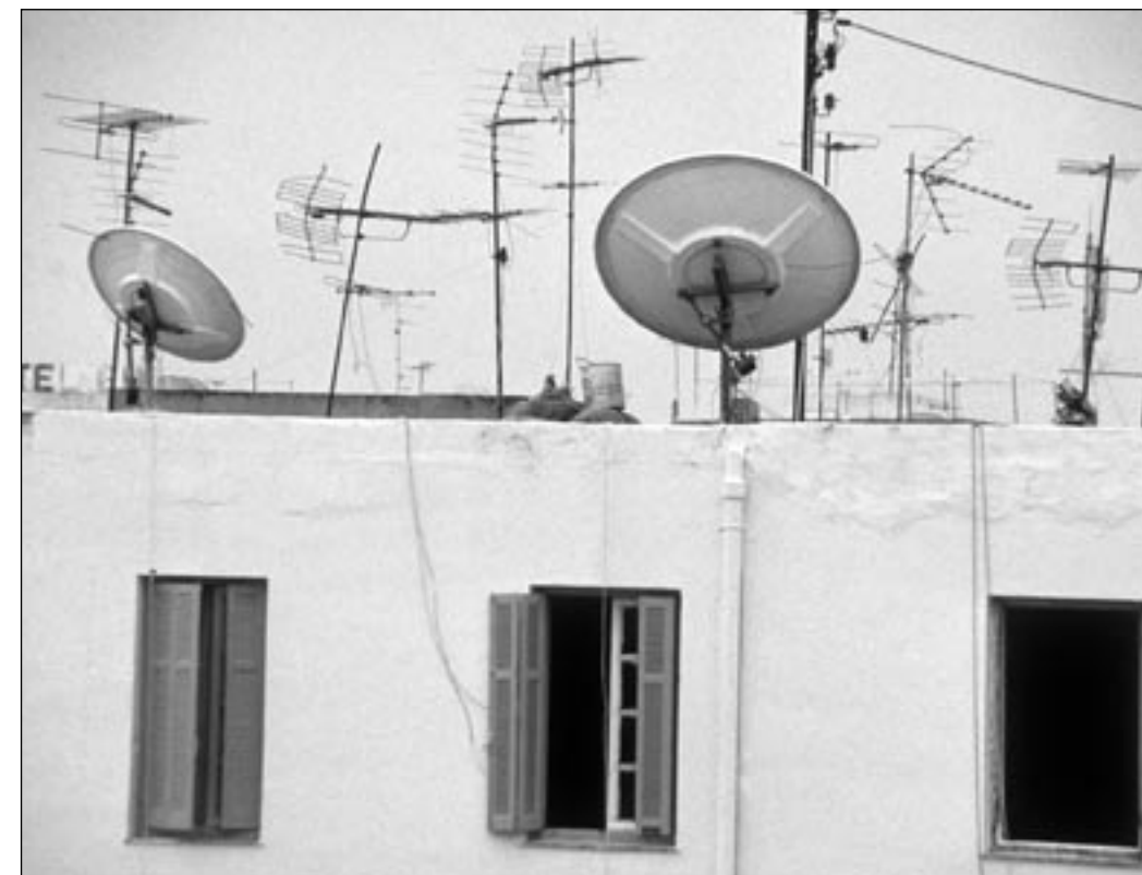
An antenna forest in Sousse (Tunisia)