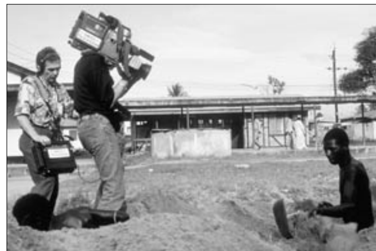
A Swiss TV-team filming an African worker digging ditches in Tanzania.

which puts a long-term perspective on poverty reduction, ensuring that it is sustainable. Such social change does not only need knowledge in order to happen, what is equally important is the organisation: "While basic legal knowledge is helpful, often the disadvantaged cannot assert their rights unless they are organised. Thus the notion of "knowledge is power" does not carry as much weight as that of "organisation is power" 76 . As has been said, ICTs do have a lot of potential