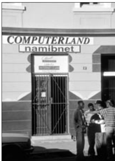
In very weakly populated Namibia wireless communication is of great significance

Practical experiences: Many successful stories that fall into this category of poverty reduction worked well for small enterprises, based on their specific needs. They mainly use the Internet as an additional marketing tool, giving them access to wider markets. The key field is the service industry. There are examples in the tourist industry (e.g. in the Kyrgyz Republic), which uses the Internet to provide information about a destination and offer its services 67 . Other examples are the selling of specific products, such as sandals. The initiators of this project highlight one of the core issues: "Our formula to effective use of ICTs is structuring the Project offline so that going online