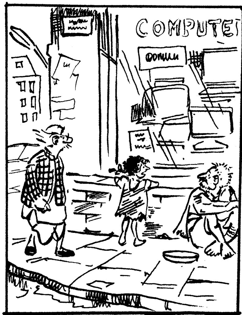
I am hungry ... if we had a computer we could have ordered food through a website ...

When I phone to talk to our development partners in the West African country Benin, we are billed one Swiss Franc per minute. If our partners phone from Benin to Switzerland, the same call costs more than four Swiss Francs per minute, although the monthly income in Benin is much lower than in Switzerland. This is only one example of the dramatic digital divide that discriminates against poor countries and limits the access of poor people to information and communication technologies (ICTs). The digital divides, however, are also a reflection of underlying deeper social, economic and political divides.