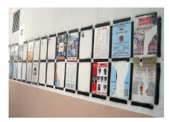
Election posters in Tunesia.

In response to the events of 2011, the Federal Council decided on 11 March 2011 to prepare a mediumterm programme for Switzerland's commitments in Tunisia. The programme for North Africa 2011-2016, based on an approach which integrates the various federal agencies, focuses on the topics of democratic transition and human rights, economic development and employment, as well as migration and protection.