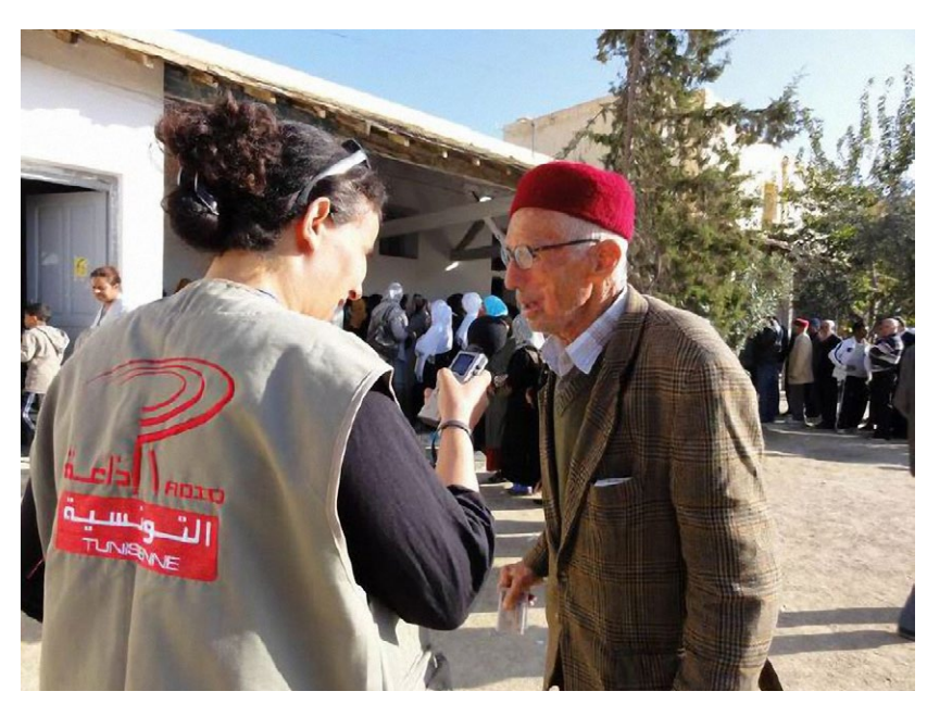
Promoting independant media coverage of high quality.

The planning of these concrete activities is currently under way.