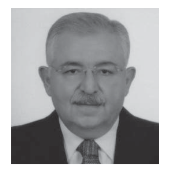
Tahsin Burcuoğlu (Turkey)

Dora Bakoyannis is a Member of the Greek Parliament. She was Minister of Foreign Affairs (2006-2009) and OSCE Chairperson-in-Office in 2009. Previously, she served as the first female Mayor of Athens (2003-2006) and was appointed Minister for Culture (1992) and Under-Secretary of State (1990). In 2009, Dora Bakovannis was named as the first female foreign associate of the French Academy of Human and Political Sciences, and as Honorary Senator of the European Academy of Sciences and Art. Prior to her political career, she worked for the Department of European Economic Community Affairs at the Ministry of Economic Co-ordination.