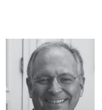
Wolfgang Ischinger (Germany) Chairperson primus inter pares of the Panel

Ambassador Ischinger is currently the Chairman of the Munich Security Conference. Before this appointment, he served as Ambassador to the United Kingdom (2006-2008) and the United States (2001-2006), and as Deputy Foreign Minister of Germany (1998-2001). In 2007, he represented the European Union in the Troika negotiations on the future of Kosovo. In 2014, he served as the Special Representative of the OSCE Chairperson-in-Office. promoting national dialogue in the Ukrainian crisis. He is a member of both the Trilateral Commission and the European Council on Foreign Relations, and serves on many non-profit boards, including SIPRI.