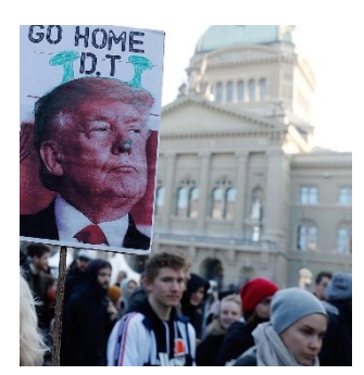
Demonstration in Bern against Donald Trump's visit to the WEF