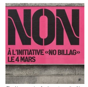
The No campaign for the vote on the 'No Billag initiative'