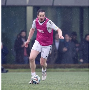
In connection with meetings between Switzerland's attorney general and FIFA's president, the senior prosecutor of the canton of Valais was also mentioned, seen here in a friendly match.