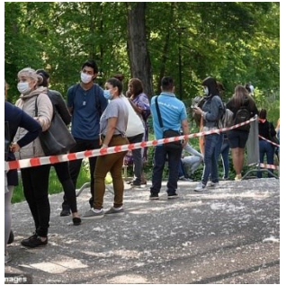
Covid-19: People in need queuing for food parcels in Geneva