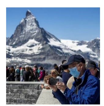
Tourists visiting the Matterhorn despite the COVID-19 pandemic