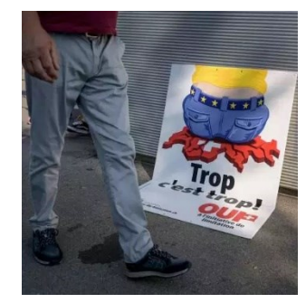
Yes campaign posters often used to il-lustrate reports on the Limitation Initiative

ported on in a neutral and factual manner. Several reports also addressed the issue of Switzerland's inclusion on the travel quarantine lists of other countries, mainly in connection with the implications of this for tourism. Favourable reporting on the Swiss economy also continued, particularly in the pandemic context whereby Switzerland was generally viewed to have struck a good balance between protecting the economy and public health.