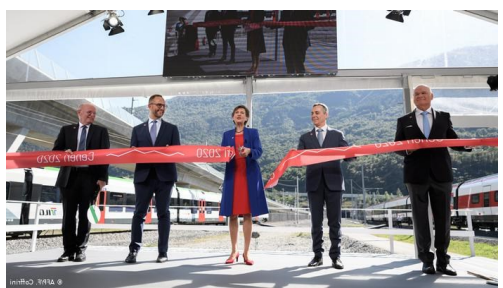
President of the Swiss Confederation Simonetta Sommaruga cutting the ribbon at the opening ceremony for the Ceneri Base Tunnel

The opening of the Ceneri Base Tunnel generated positive reviews in foreign media, particularly in neighbouring