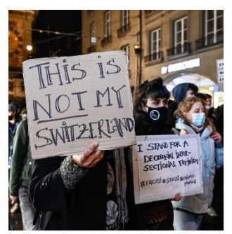
Images of demonstrations accompany coverage of the adoption of the 'Yes to the burga ban' initiative

entire commodities sector. Overall, reporting promoted the image of a Switzerland committed to fighting corruption. Only a few media also reported criticism by a Swiss NGO, saying that Switzerland needs to close legal loopholes that facilitate criminal business practices.