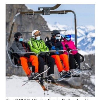
The COVID-19 situation in Switzerland is often illustrated by pictures of ski resorts