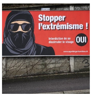
Poster for the initiative