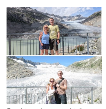
Two pictures taken by a tourist 15 years apart from the same spot showing the enormous retreat of the Rhone glacier went viral on social media.