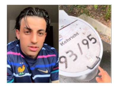
On the TikTok account suiza.en.español, a Spaniard living in Switzerland explains how strict and, above all, expensive Swiss waste disposal regulations can be.

currently regularly publishing curious anecdotes and experiences from Spaniards living in Switzerland, which are subsequently reported on by various leading Spanish media outlets. In terms of content, the articles range from concrete help and tips for new arrivals in the country to factual explanations of everyday life in Switzerland. Sometimes social character-