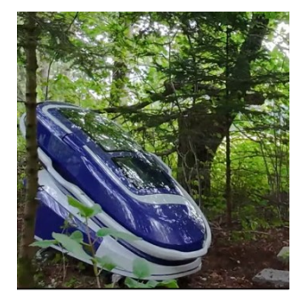
The 'Sarco' suicide capsule in a forest in Switzerland, where it was used for the first time in September.

erally objective, underscoring that although euthanasia is handled more liberally in Switzerland than in other countries, it is strictly regulated. Reports also noted the Federal Council's position that the use of the suicide capsule contravened Swiss law. Its unlawful use also caused a stir in Switzerland.