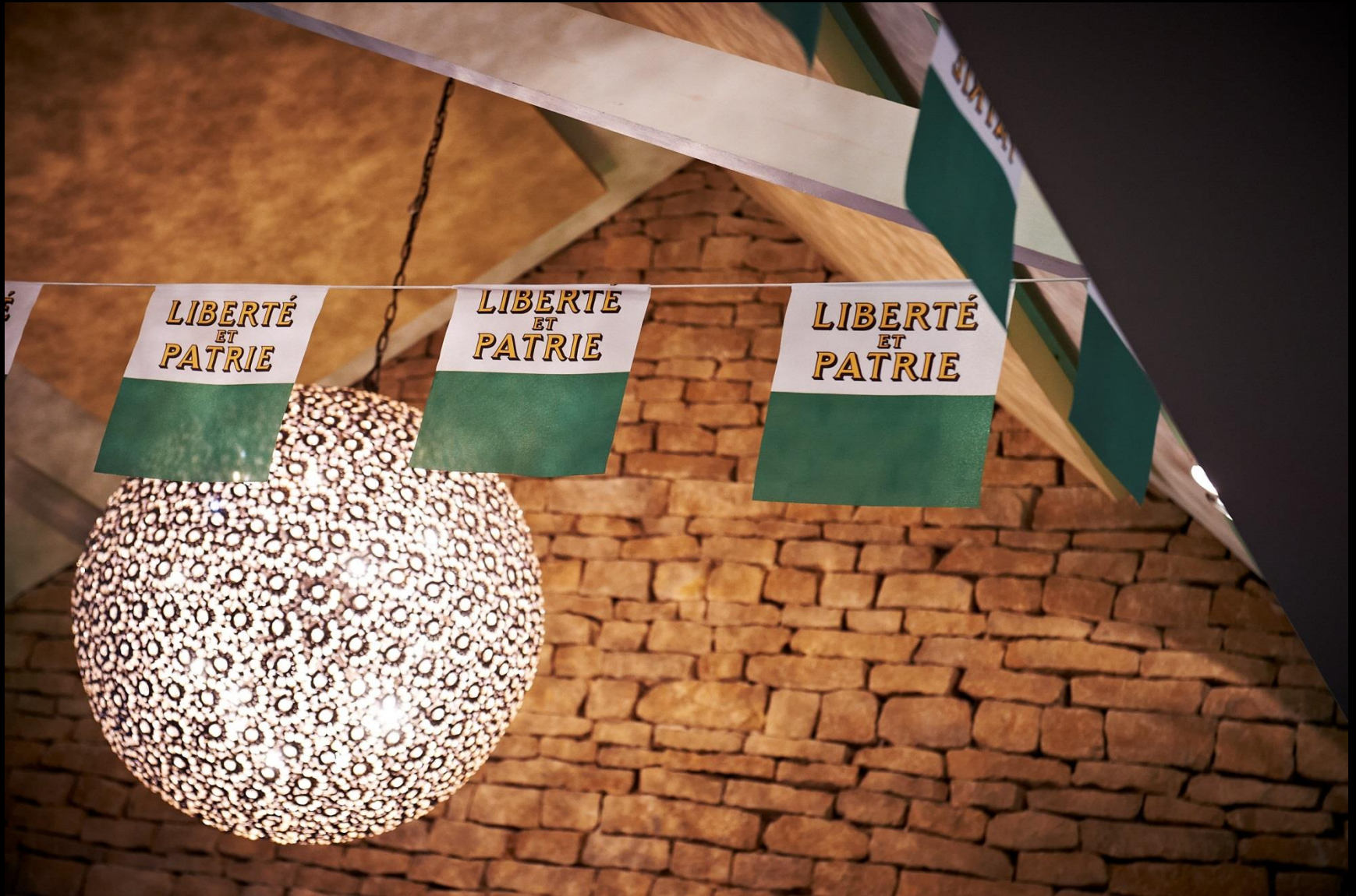
The canton Vaud sponsored a wide range of traditional food produced locally in the canton Vaud