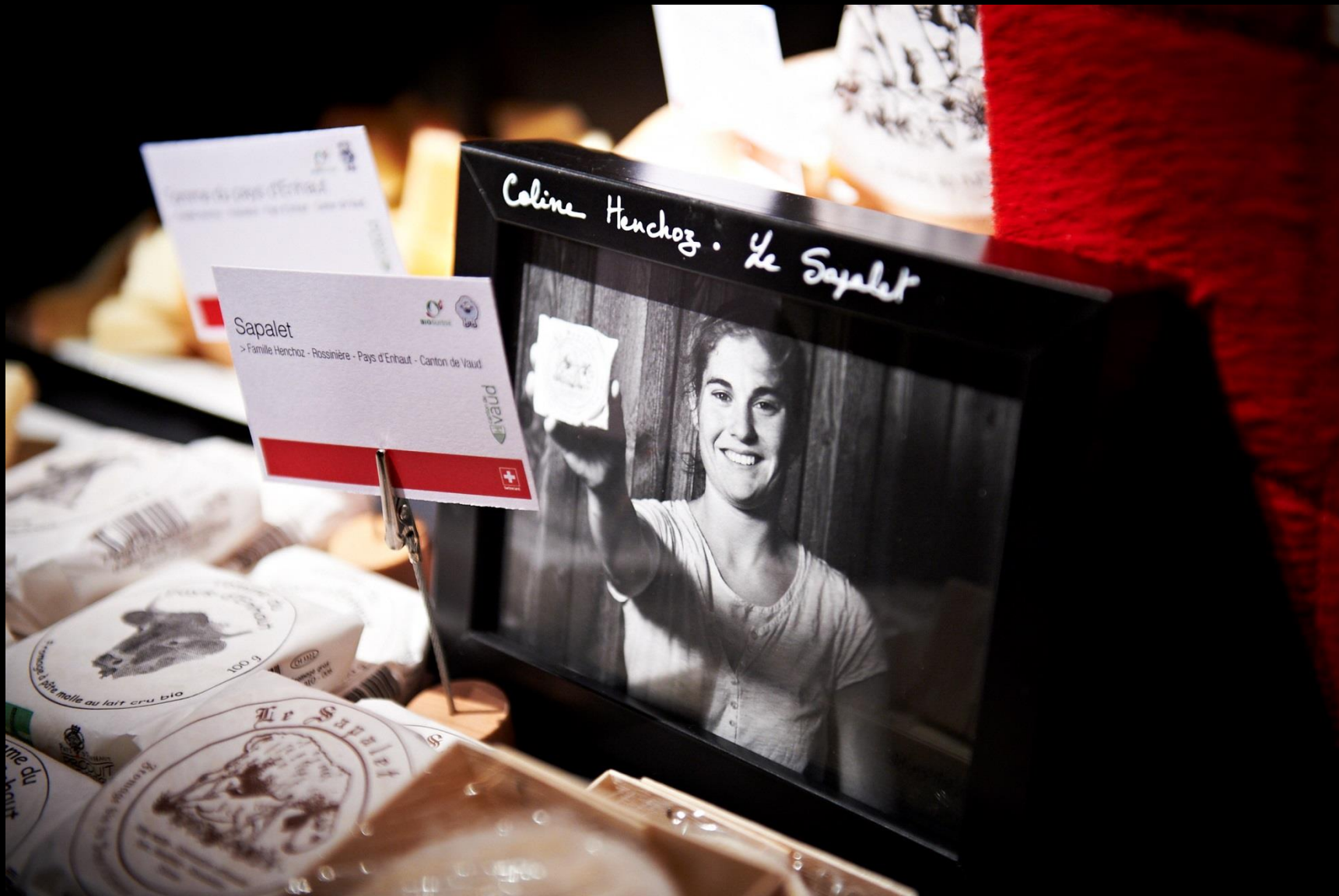
The picture of the producer of the Sapalet cheese