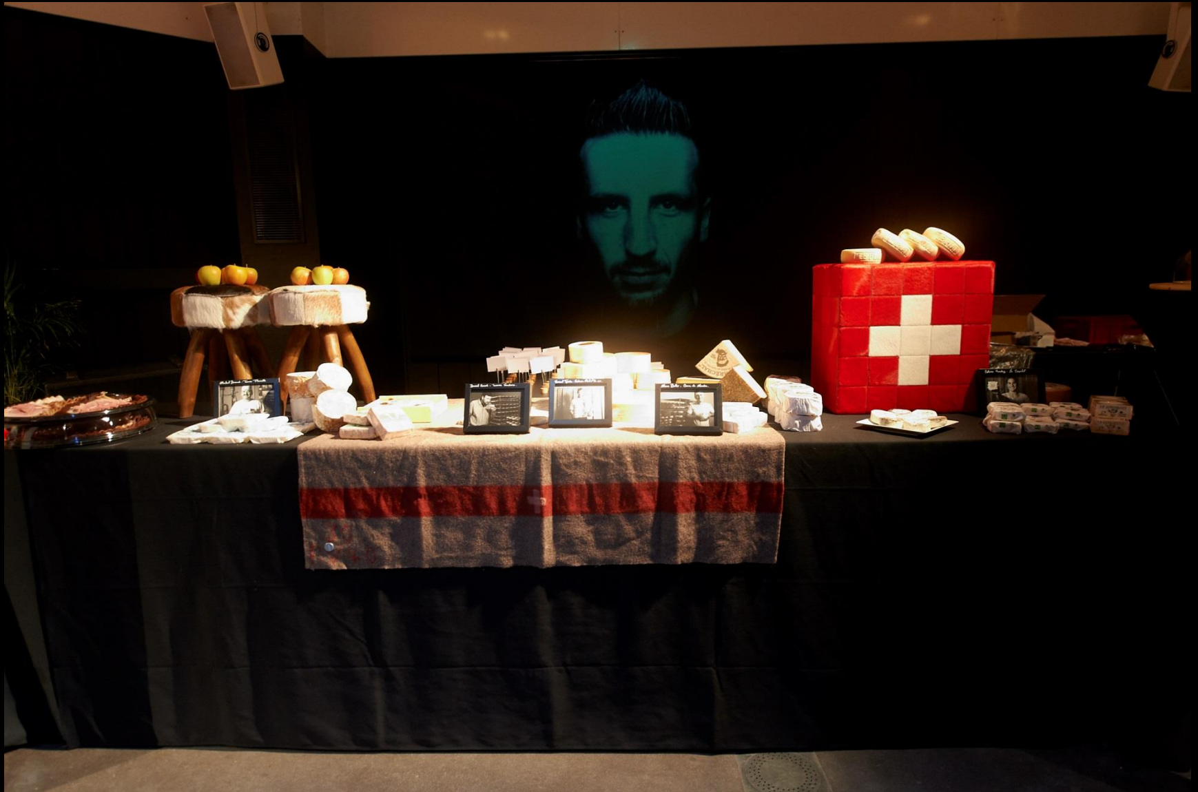
At this gastronomic evening, the guests could taste various Swiss specialities