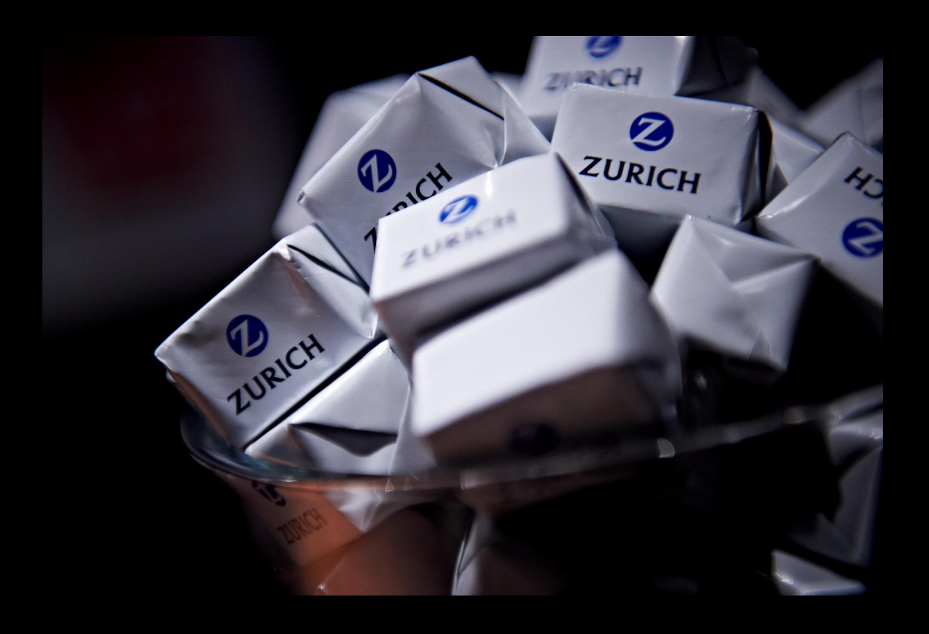
Zurich Insurances have through their sponsoring also contributed to the success of the event