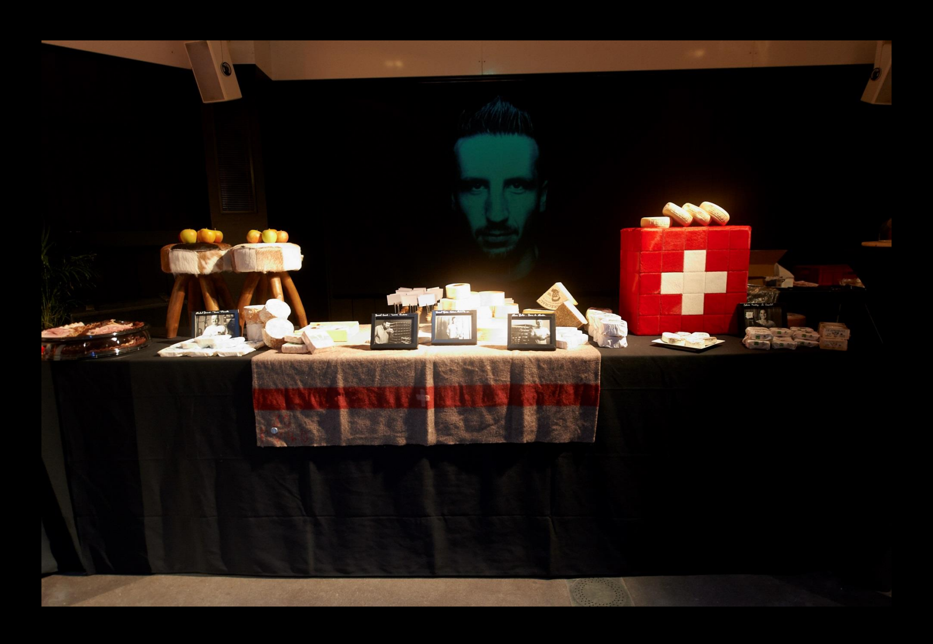
At this gastronomic evening, the guests could taste various Swiss specialities