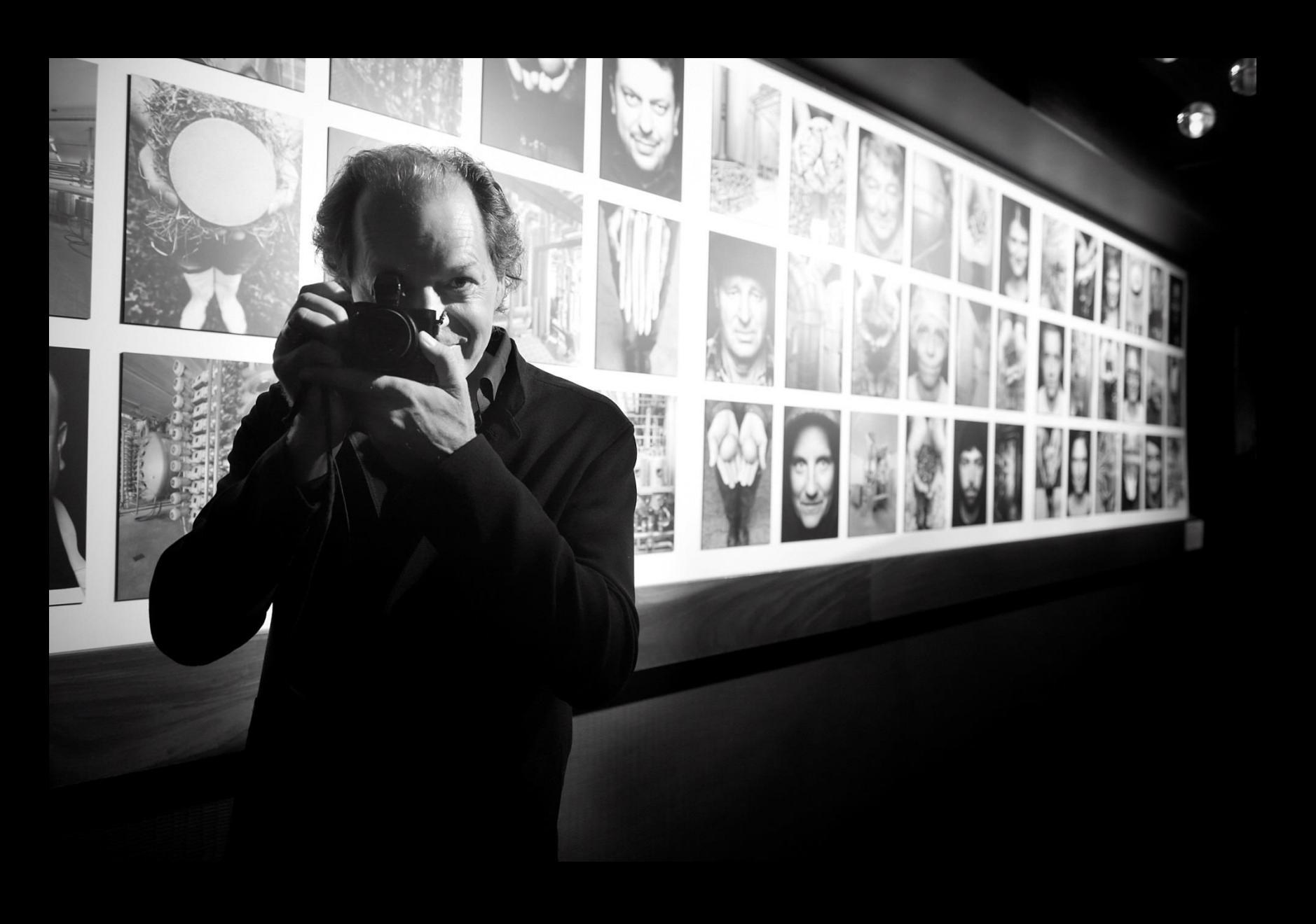
The photographic project «At the roots of food and agriculture innvovations» by the Swiss photographer Marco D'Anna guided the guests through the evening