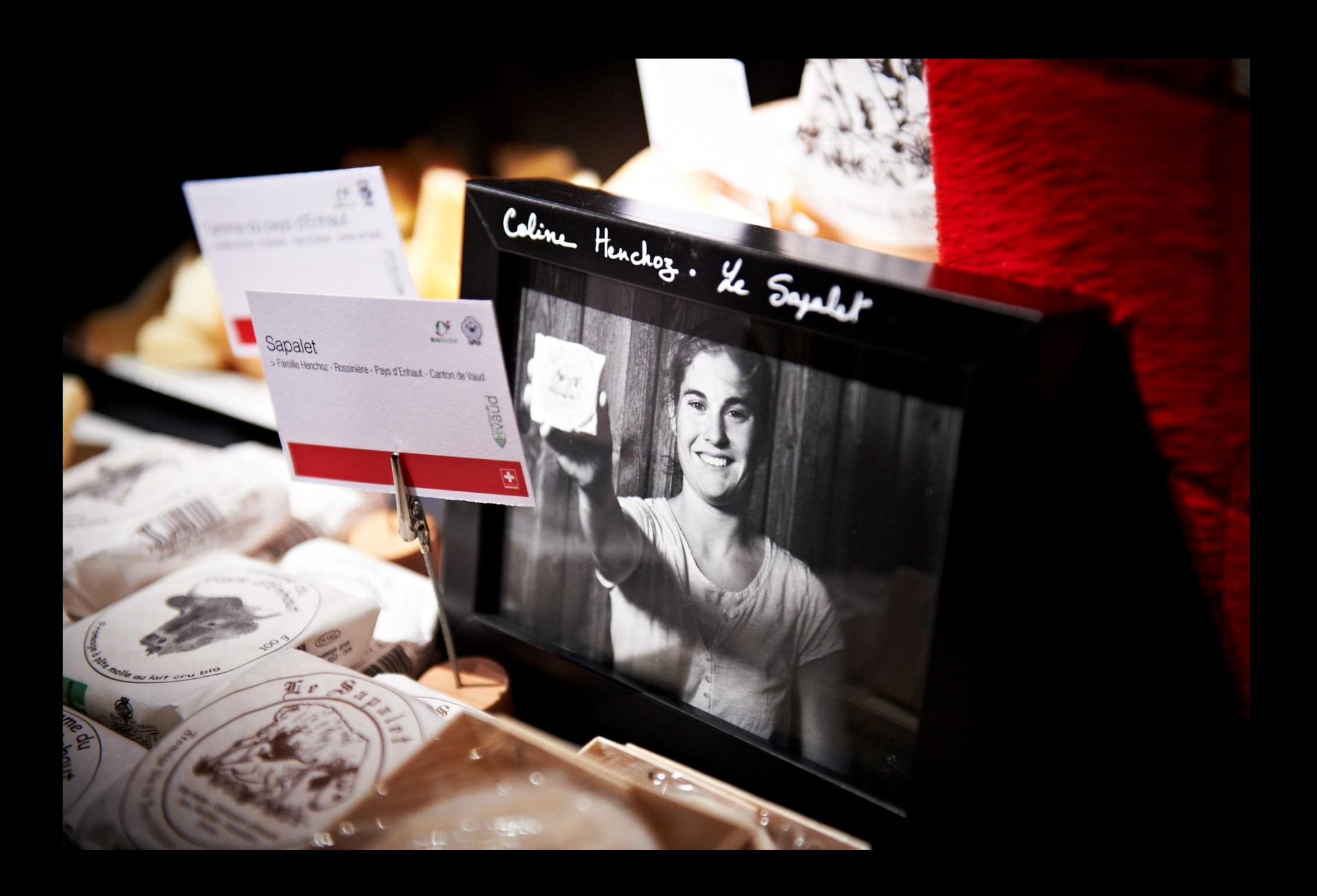
The picture of the producer of the Sapalet cheese