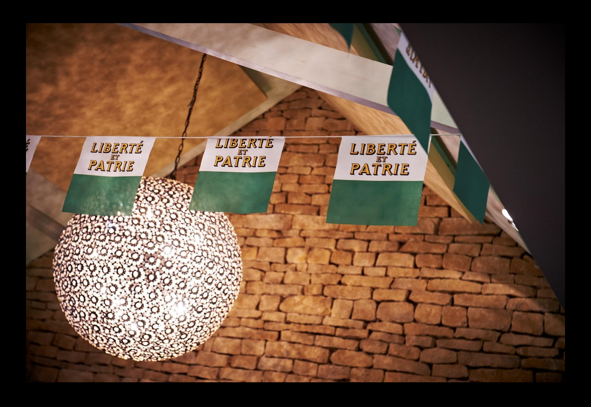
The canton Vaud sponsered a wide range of traditional food produced locally in the canton Vaud