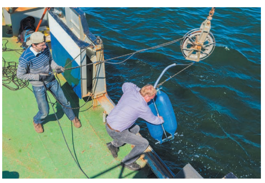
The project in Estonia mentioned in the interview is part of an environmental monitoring programme which Switzerland is supporting with CHF 8.5 million. Switzerland and Estonia have equipped eleven laboratories and monitoring stations in Estonia with modern equipment and are financing staff training. This provides Estonia with comprehensive and reliable environmental data in the areas of water, air, nuclear radiation and natural hazards.

Leica was already present in these markets. Nevertheless, awarded contracts strengthen our foothold in the country.