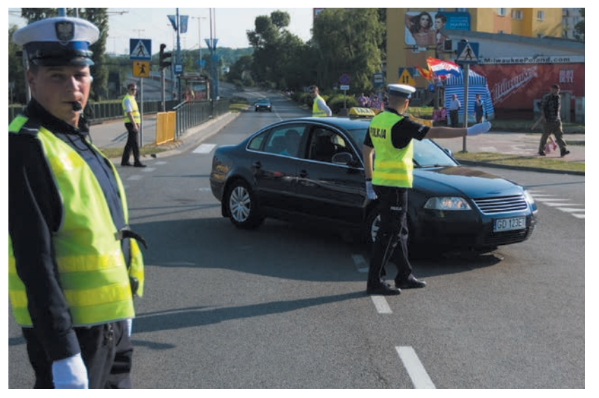
More than 600 members of the Polish police received training on the issue of traffic safety. This enables traffic monitoring to be structured in a more efficient and effective manner.

port victims. The revision of the legislation in Poland shows the possible effect of a single project at the political level and the positive changes that can come from bilateral dialogue and the exchange of Swiss specialist knowledge.