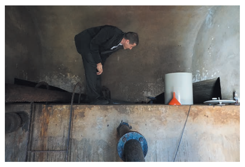
A Swiss expert inspects the existing drinking water reservoir in the Croatian district of Fužine which was built in 1960.