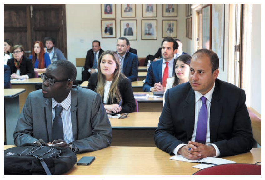
60 young diplomats from North Africa and the Middle East deepened their knowledge about human rights, governance and democracy with a master's degree at the Mediterranean Academy of Diplomatic Studies (MEDAC).

diplomats from North Africa and the Middle East have acquired important knowledge about human rights, democracy and governance through a master's degree programme. Establishing the alumni network encourages contact between the academy graduates and with it collaboration between the Mediterranean countries. The Swiss professorial chair at the academy has strengthened the partnership between Switzerland and Malta, and Swiss visiting lecturers have had the opportunity to teach at the MEDAC. Switzerland provided financial support to the MEDAC of CHF 1.9 million from Switzerland's EU-enlargement contribution. Switzerland and Malta will continue to work together now that the project is over.