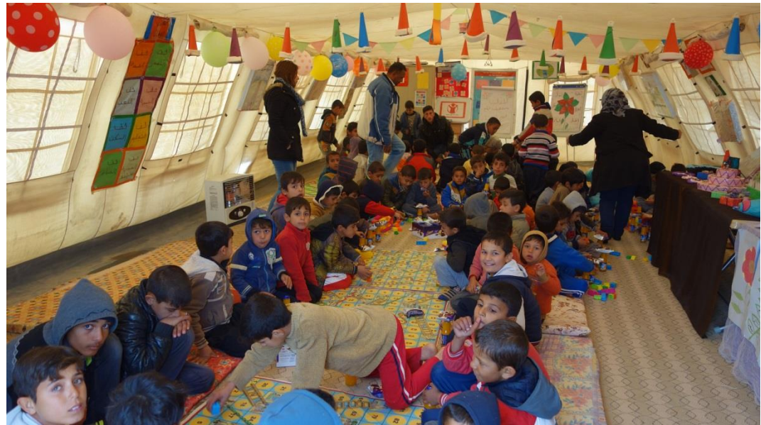
Child Friendly Space